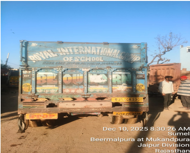
Dec 10, 2025 8:30:26 AM Sumel Beermalpura at Mukandpura Jaipur Division Rajasthan