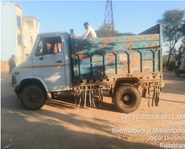
Dec 10, 2025 8:30:11 AM Sumel Beermalpura at Mukandpura Jaipur Division Rajasthan