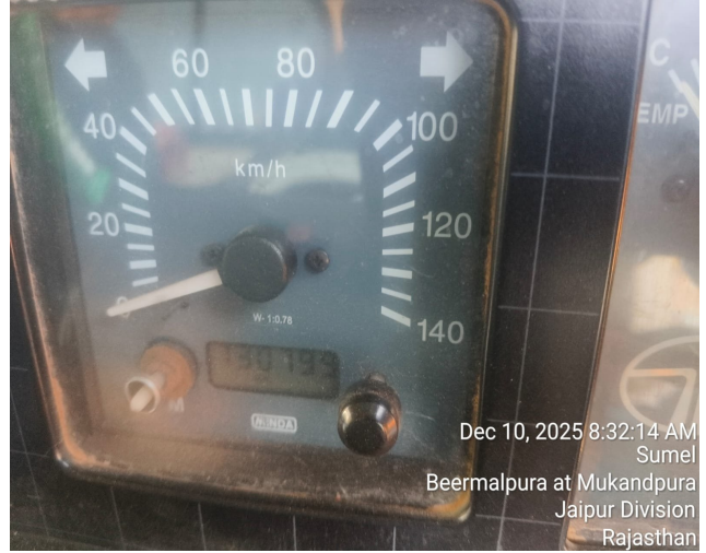
Dec 10, 2025 8:32:14 AM Sumel Beermalpura at Mukandpura Jaipur Division Rajasthan