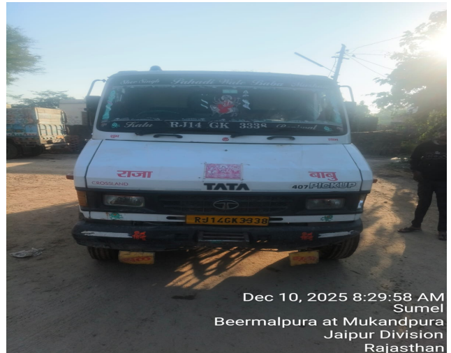
Dec 10, 2025 8:29:58 AM Sumel Beermalpura at Mukandpura Jaipur Division Rajasthan