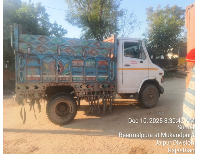
Dec 10, 2025 8:30:42 AM Sumel Beermalpura at Mukandpura Jaipur Division Rajasthan