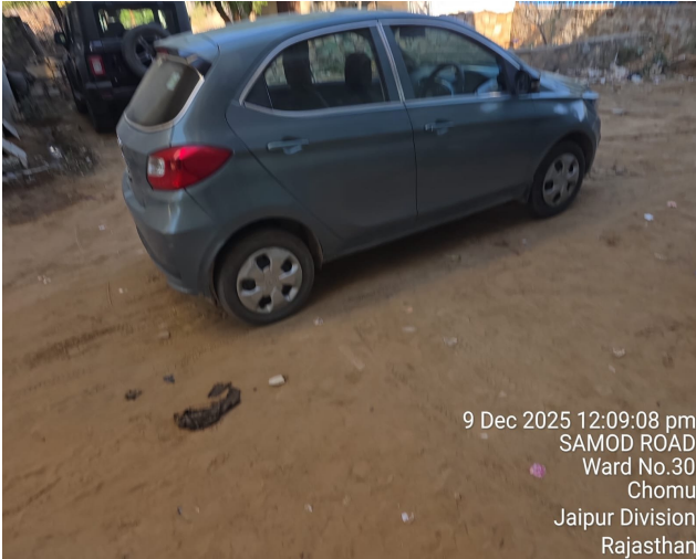
9 Dec 2025 12:09:08 pm SAMOD ROAD Ward No.30 Chomu Jaipur Division Rajasthan