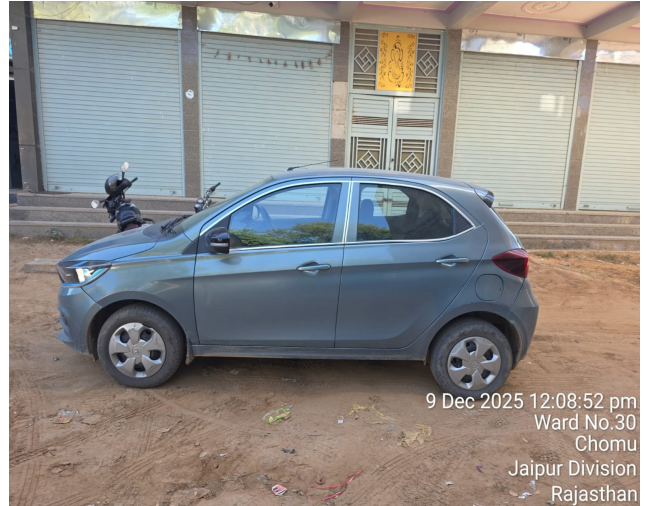
9 Dec 2025 12:08:52 pm Ward No.30 Chomu Jaipur Division Rajasthan