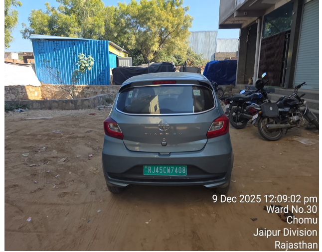
9 Dec 2025 12:09:02 pm Ward No.30 Chomu Jaipur Division Rajasthan