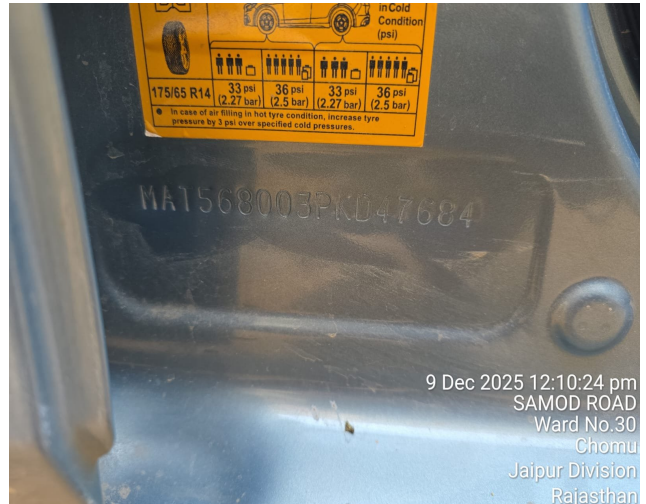
9 Dec 2025 12:10:24 pm SAMOD ROAD Ward No.30 Chomu Jaipur Division Rajasthan