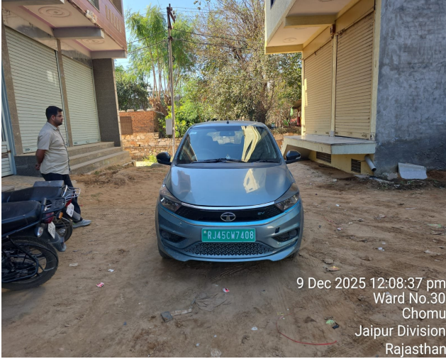
9 Dec 2025 12:08:37 pm Ward No.30 Chomu Jaipur Division Rajasthan

Surveyor & Loss Assessor (SLA / 65869 Valid up to 27-09-27)