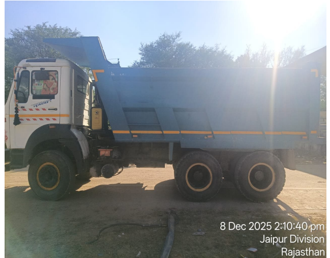
8 Dec 2025 2:10:40 pm Jaipur Division Rajasthan