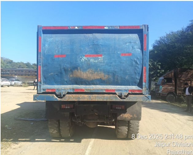
8 Dec 2025 2:11:48 pm Jaipur Division Rajasthan