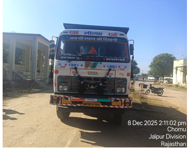
8 Dec 2025 2:11:02 pm Chomu Jaipur Division Rajasthan