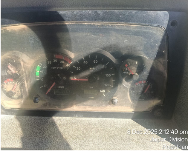
8 Dec 2025 2:12:49 pm Jaipur Division Rajasthan

Surveyor & Loss Assessor (SLA / 65869 Valid up to 27-09-27)