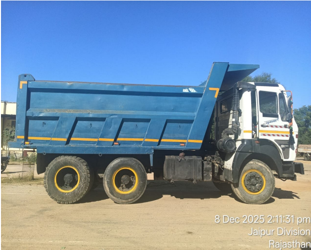
8 Dec 2025 2:11:31 pm Jaipur Division Rajasthan