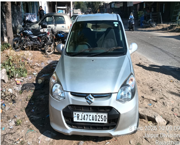
8 Dec 2025 10:08:09 Jaipur Division Rajasthan