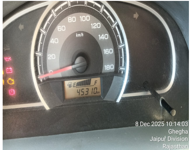
8 Dec 2025 10:14:03 Gheghha Jaipur Division Rajasthan