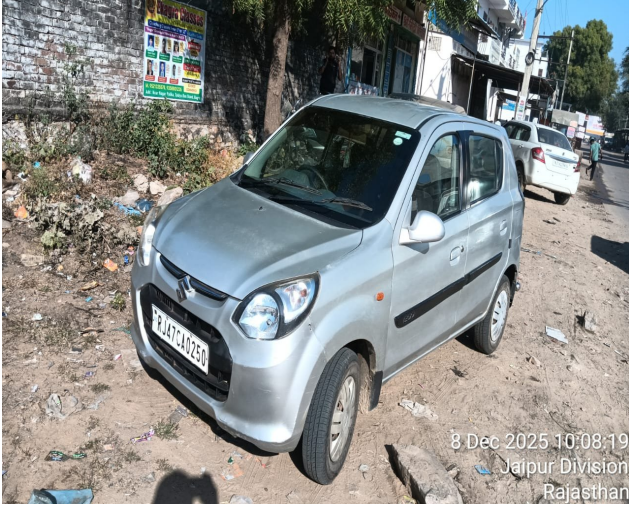
8 Dec 2025 10:08:19 Jaipur Division Rajasthan

Surveyor & Loss Assessor (SLA / 65869 Valid up to 27-09-27)