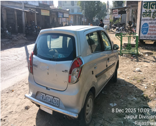
8 Dec 2025 10:09:19 Jaipur Division Rajasthan