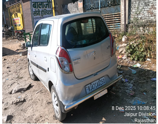
8 Dec 2025 10:08:45 Jaipur Division Rajasthan