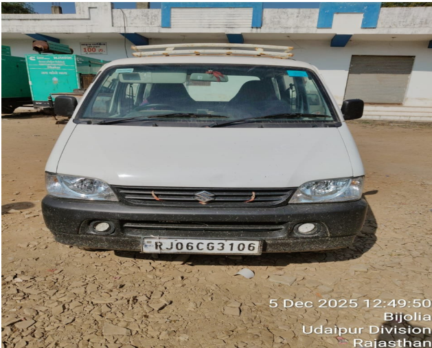
5 Dec 2025 12:49:50 Bijolia Udaipur Division Rajasthan