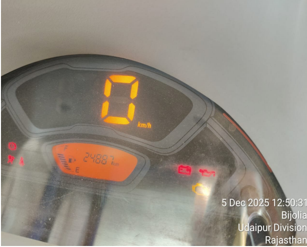
5 Dec 2025 12:50:31 Bijolia Udaipur Division Rajasthan

Surveyor & Loss Assessor (SLA / 65869 Valid up to 27-09-27)