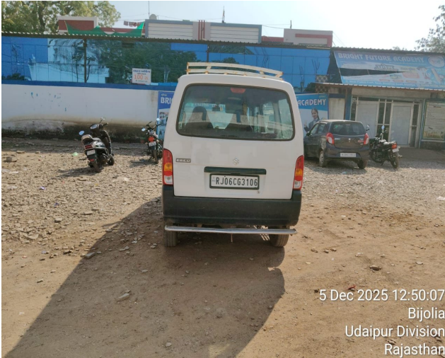
5 Dec 2025 12:50:07 Bijolia Udaipur Division Rajasthan