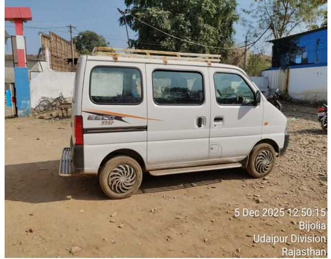
5 Dec 2025 12:50:15 Bijolia Udaipur Division Rajasthan