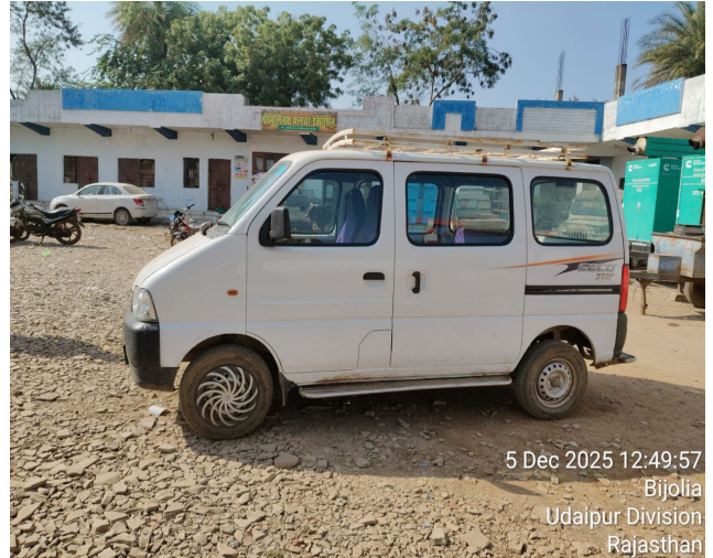
5 Dec 2025 12:49:57 Bijolia Udaipur Division Rajasthan