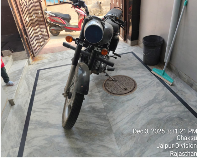
Dec 3, 2025 3:31:21 PM Chaksu Jaipur Division Rajasthan

Surveyor & Loss Assessor (SLA / 65869 Valid up to 27-09-27)