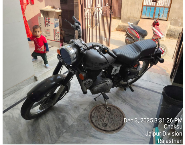
Dec 3, 2025 3:31:26 PM Chaksu Jaipur Division Rajasthan