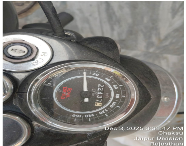
Dec 3, 2025 3:31:47 PM Chaksu Jaipur Division Rajasthan