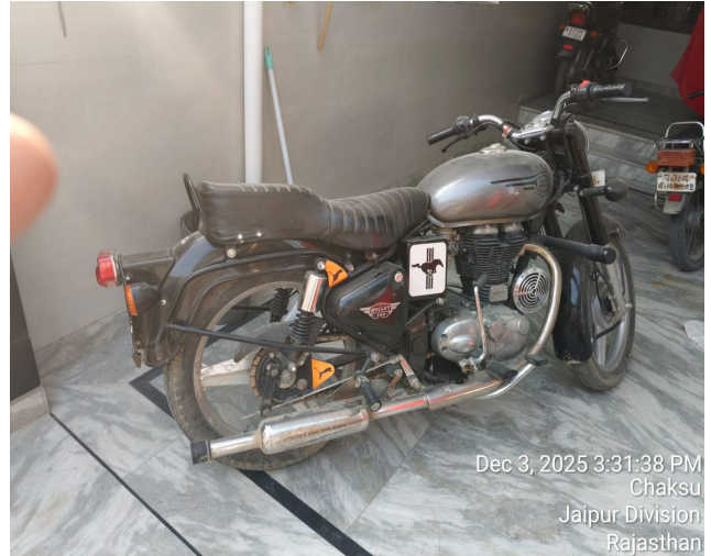
Dec 3, 2025 3:31:38 PM Chaksu Jaipur Division Rajasthan