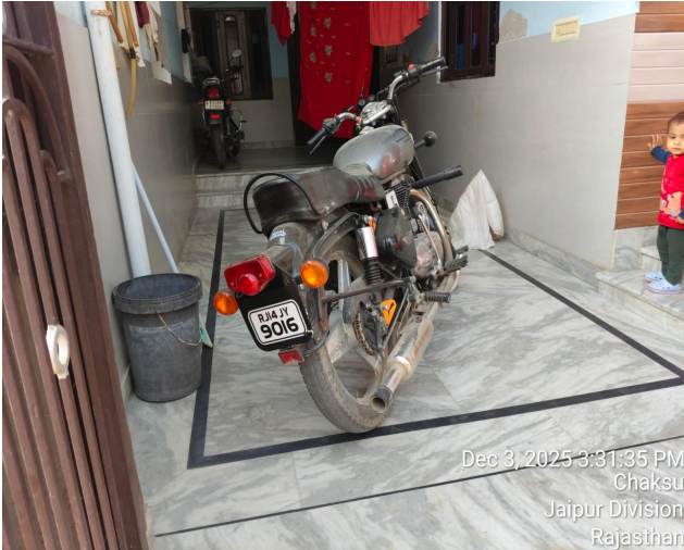
Dec 3, 2025 3:31:35 PM Chaksu Jaipur Division Rajasthan