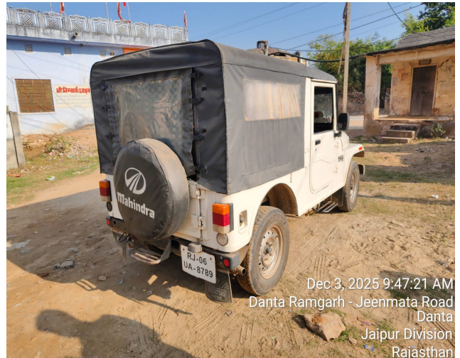
Dec 3, 2025 9:47:21 AM Danta Ramgarh - Jeenmata Road Danta Jaipur Division Rajasthan