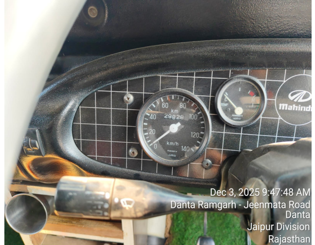
Dec 3, 2025 9:47:48 AM Danta Ramgarh - Jeenmata Road Danta Jaipur Division Rajasthan