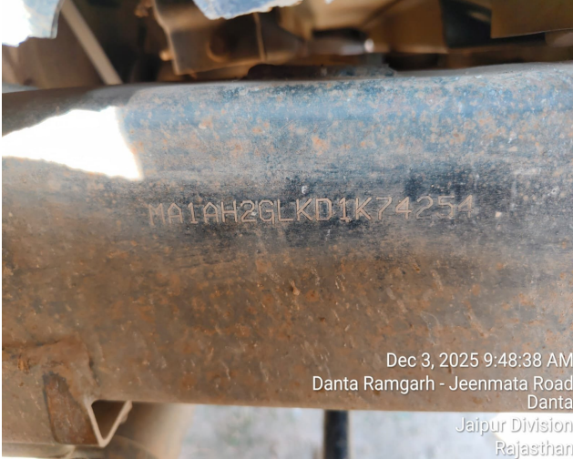
Dec 3, 2025 9:48:38 AM Danta Ramgarh - Jeenmata Road Danta Jaipur Division Rajasthan

Surveyor & Loss Assessor (SLA / 65869 Valid up to 27-09-27)