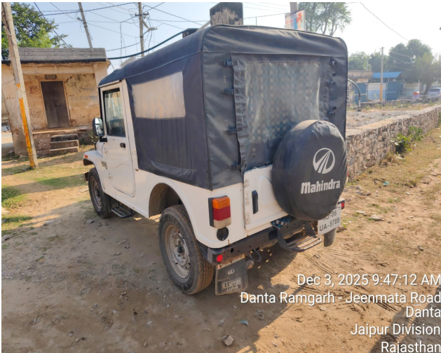
Dec 3, 2025 9:47:12 AM Danta Ramgarh - Jeenmata Road Danta Jaipur Division Rajasthan