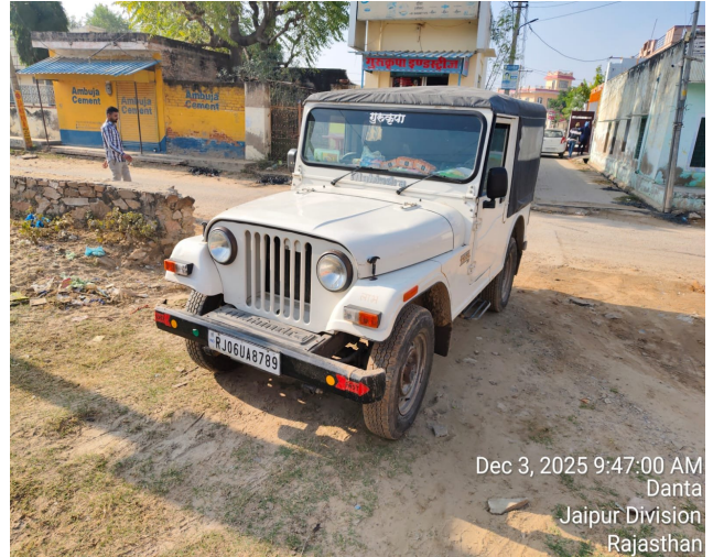
Dec 3, 2025 9:47:00 AM Danta Jaipur Division Rajasthan