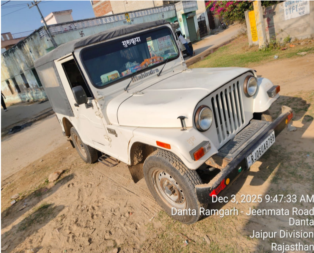
Dec 3, 2025 9:47:33 AM Danta Ramgarh - Jeenmata Road Danta Jaipur Division Rajasthan