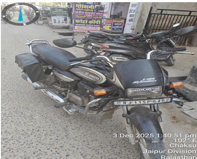
3 Dec 2025 1:40:51 pm 102° E Chaksu Jaipur Division Rajasthan