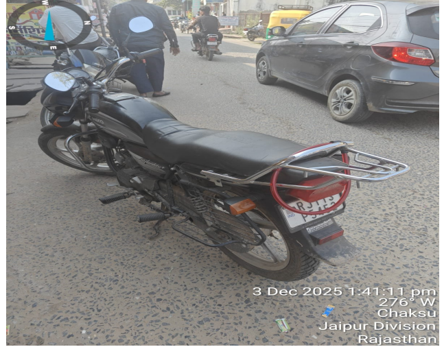
3 Dec 2025 1:41:11 pm 276° W Chaksu Jaipur Division Rajasthan