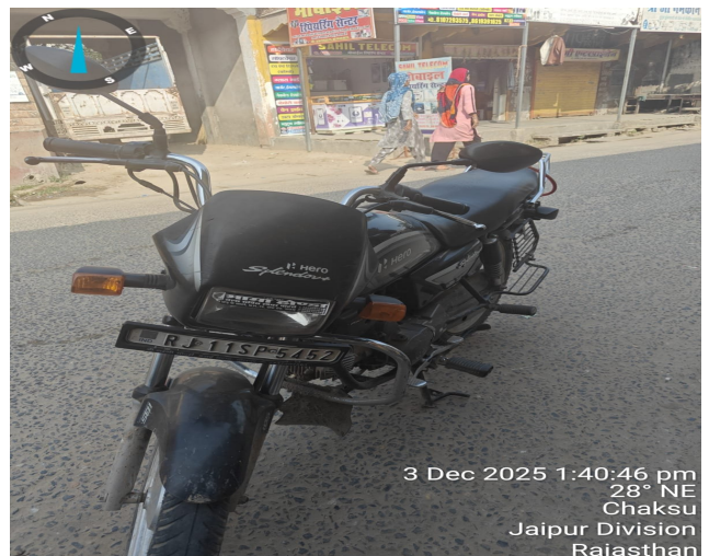
3 Dec 2025 1:40:46 pm 28° NE Chaksu Jaipur Division Rajasthan