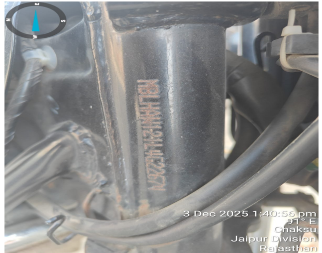
3 Dec 2025 1:40:56 pm 91° E Chaksu Jaipur Division Rajasthan