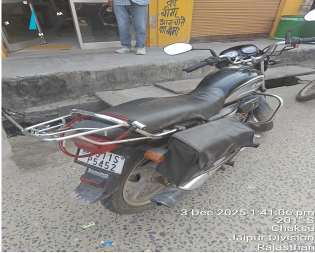
3 Dec 2025 1:41:06 pm 201° S Chaksu Jaipur Division Rajasthan

Surveyor & Loss Assessor (SLA / 65869 Valid up to 27-09-27)