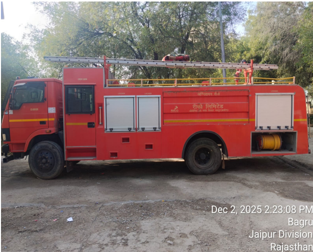
Dec 2, 2025 2:23:08 PM Bagru Jaipur Division Rajasthan