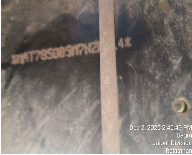
Dec 2, 2025 2:40:49 PM Bagru Jaipur Division Rajasthan

Surveyor & Loss Assessor (SLA / 65869 Valid up to 27-09-27)