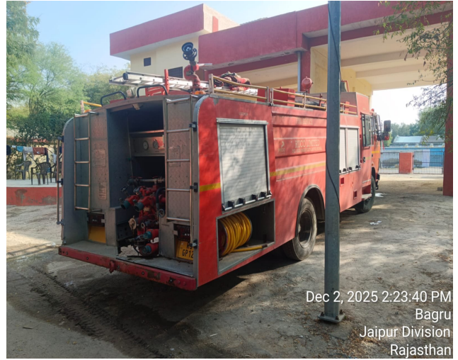
Dec 2, 2025 2:23:40 PM Bagru Jaipur Division Rajasthan