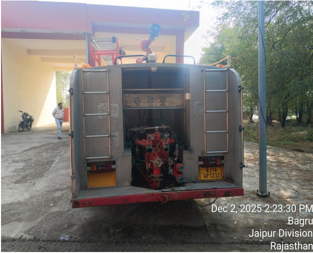
Dec 2, 2025 2:23:30 PM Bagru Jaipur Division Rajasthan