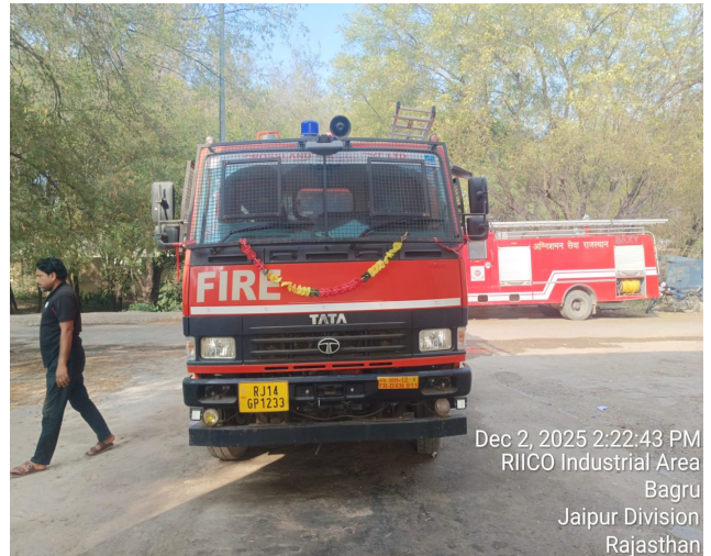
Dec 2, 2025 2:22:43 PM RIICO Industrial Area Bagru Jaipur Division Rajasthan