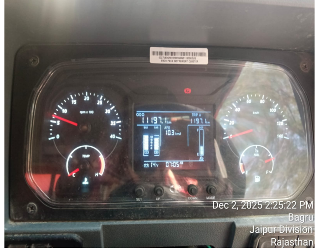
Dec 2, 2025 2:25:22 PM Bagru Jaipur Division Rajasthan