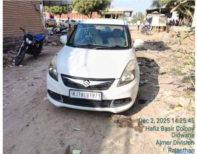
Dec 2, 2025 14:25:45 Hafiz Basir Colony Didwana Ajmer Division Rajasthan