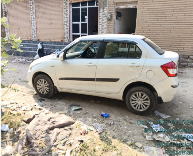
Dec 2, 2025 14:25:24 Hafiz Basir Colony Didwana Ajmer Division Rajasthan