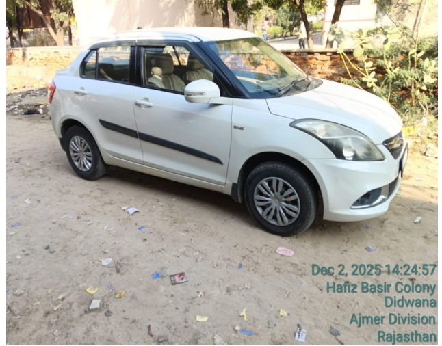
Dec 2, 2025 14:24:57 Hafiz Basir Colony Didwana Ajmer Division Rajasthan