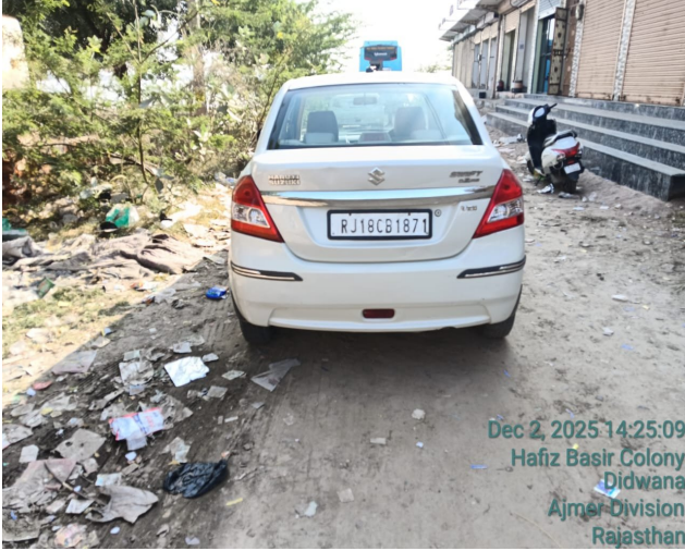
Dec 2, 2025 14:25:09 Hafiz Basir Colony Didwana Ajmer Division Rajasthan

Surveyor & Loss Assessor (SLA / 65869 Valid up to 27-09-27)