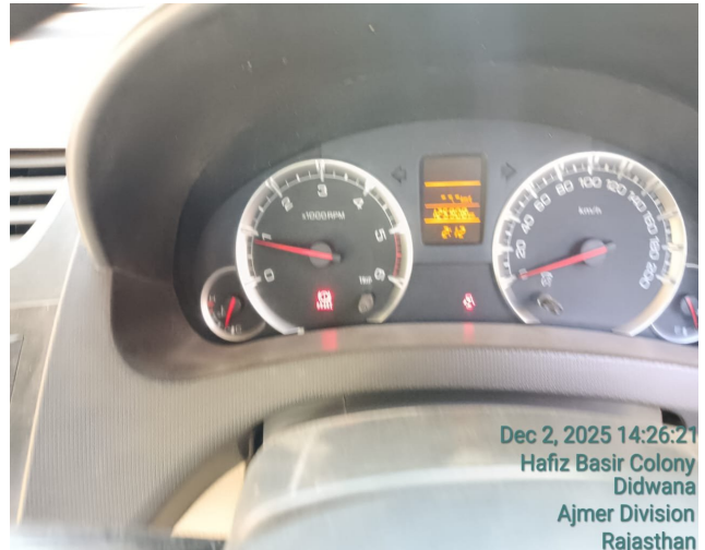
Dec 2, 2025 14:26:21 Hafiz Basir Colony Didwana Ajmer Division Rajasthan