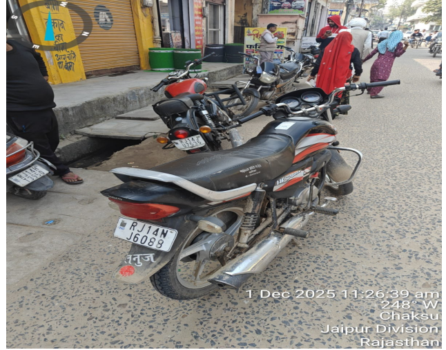
1 Dec 2025 11:26:39 am 248° W Chaksu Jaipur Division Rajasthan