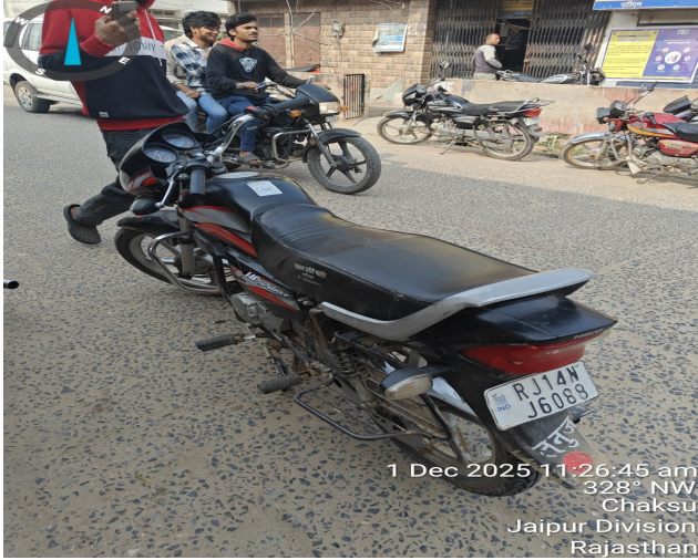
1 Dec 2025 11:26:45 am 328° NW Chaksu Jaipur Division Rajasthan

Surveyor & Loss Assessor (SLA / 65869 Valid up to 27-09-27)