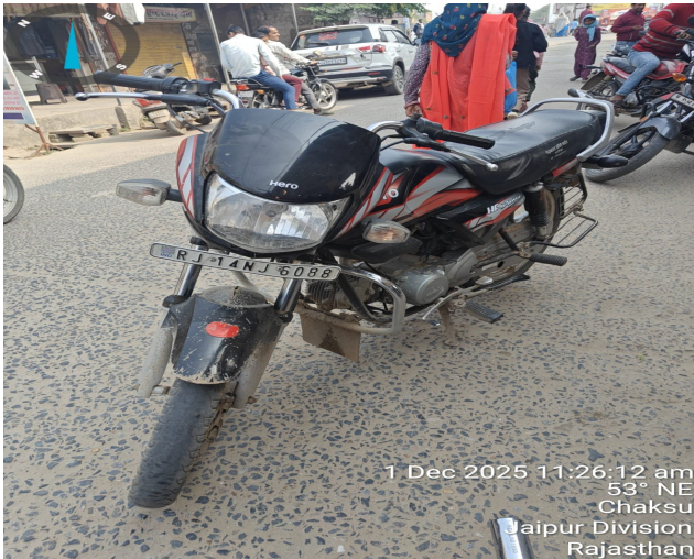
1 Dec 2025 11:26:12 am 53° NE Chaksu Jaipur Division Rajasthan