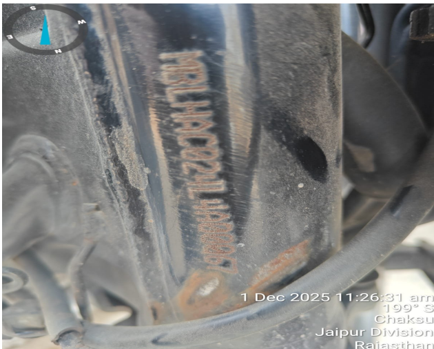
1 Dec 2025 11:26:31 am 199° S Chaksu Jaipur Division Rajasthan