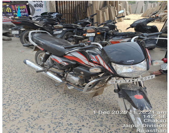
1 Dec 2025 11:26:21 am 142° SE Chaksu Jaipur Division Rajasthan