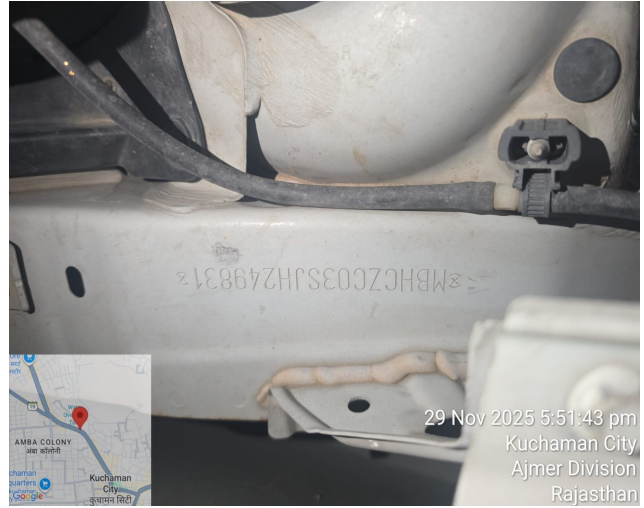
29 Nov 2025 5:51:43 pm Kuchaman City Ajmer Division Rajasthan