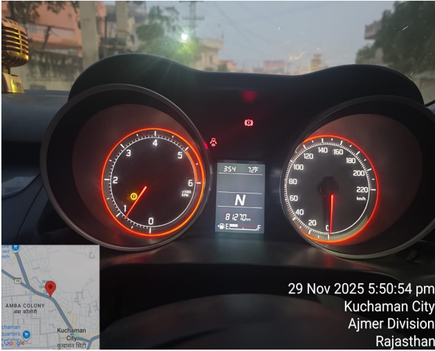
29 Nov 2025 5:50:54 pm Kuchaman City Ajmer Division Rajasthan

Surveyor & Loss Assessor (SLA / 65869 Valid up to 27-09-27)