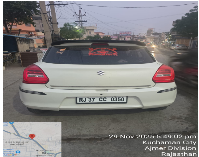
29 Nov 2025 5:49:02 pm Kuchaman City Ajmer Division Rajasthan