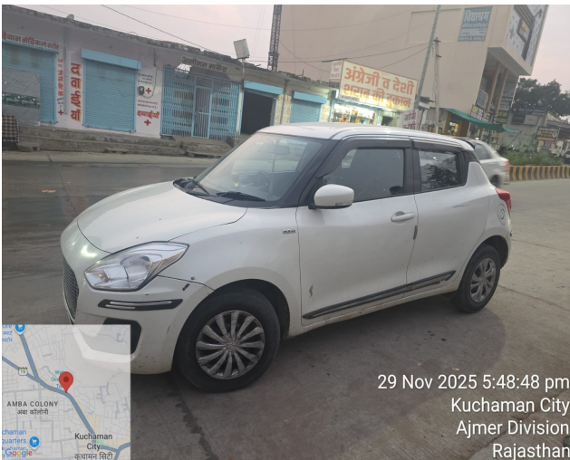
29 Nov 2025 5:48:48 pm Kuchaman City Ajmer Division Rajasthan