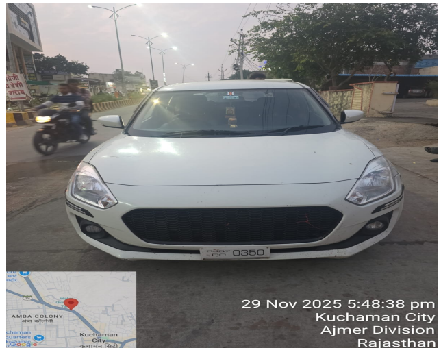
29 Nov 2025 5:48:38 pm Kuchaman City Ajmer Division Rajasthan