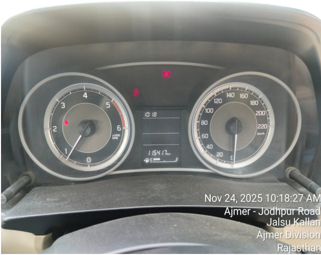
Nov 24, 2025 10:18:27 AM Ajmer - Jodhpur Road Jalsu Kallan Ajmer Division Rajasthan