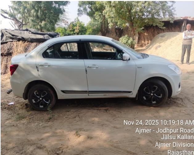
Nov 24, 2025 10:19:18 AM Ajmer - Jodhpur Road Jalsu Kallan Ajmer Division Rajasthan