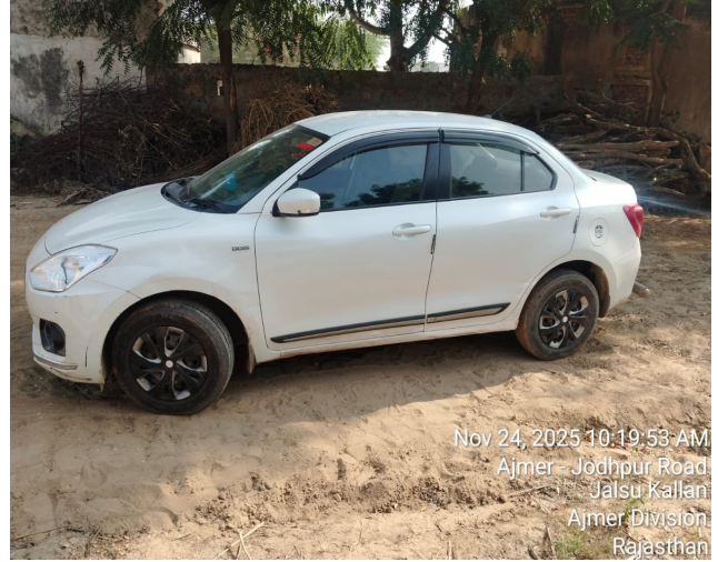
Nov 24, 2025 10:19:53 AM Ajmer - Jodhpur Road Jalsu Kallan Ajmer Division Rajasthan