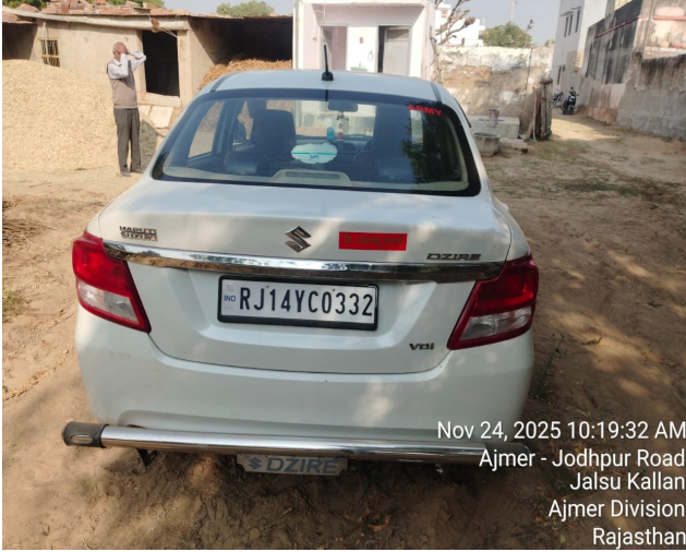
Nov 24, 2025 10:19:32 AM Ajmer - Jodhpur Road Jalsu Kallan Ajmer Division Rajasthan

Surveyor & Loss Assessor (SLA / 65869 Valid up to 27-09-27)