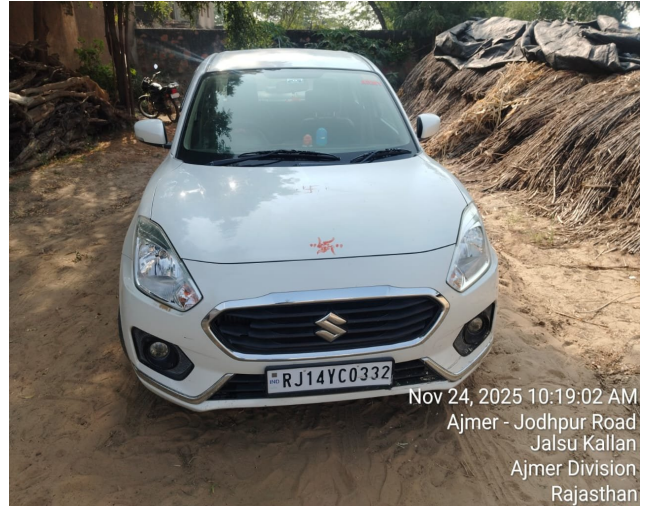
Nov 24, 2025 10:19:02 AM Ajmer - Jodhpur Road Jalsu Kallan Ajmer Division Rajasthan