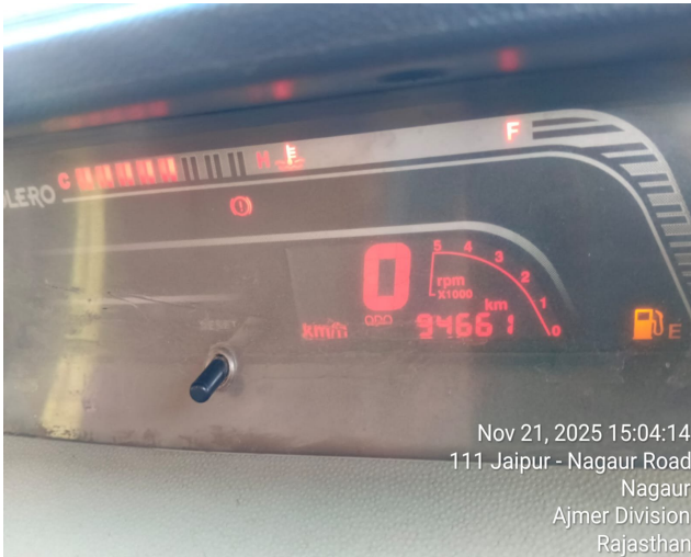
Nov 21, 2025 15:04:14 111 Jaipur - Nagaur Road Nagaur Ajmer Division Rajasthan