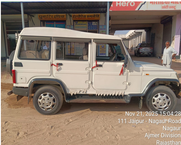
Nov 21, 2025 15:04:28 111 Jaipur - Nagaur Road Nagaur Ajmer Division Rajasthan