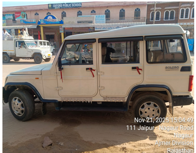
Nov 21, 2025 15:04:49 111 Jaipur - Nagaur Road Nagaur Ajmer Division Rajasthan