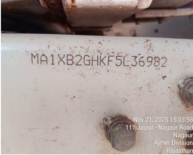
Nov 21, 2025 15:03:58 111 Jaipur - Nagaur Road Nagaur Ajmer Division Rajasthan

Surveyor & Loss Assessor (SLA / 65869 Valid up to 27-09-27)