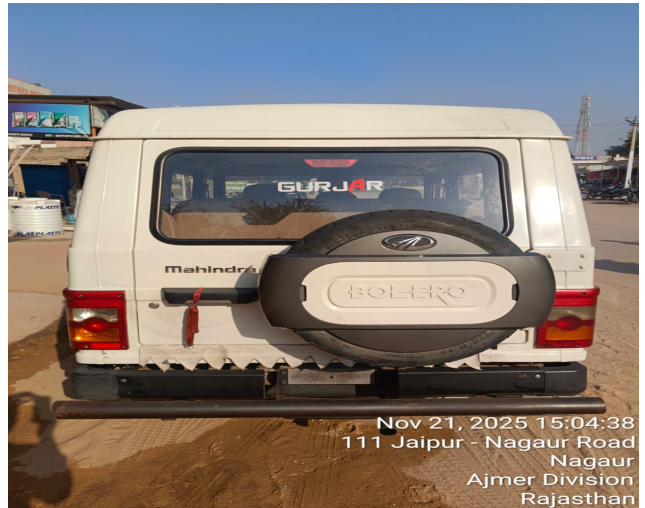
Nov 21, 2025 15:04:38 111 Jaipur - Nagaur Road Nagaur Ajmer Division Rajasthan