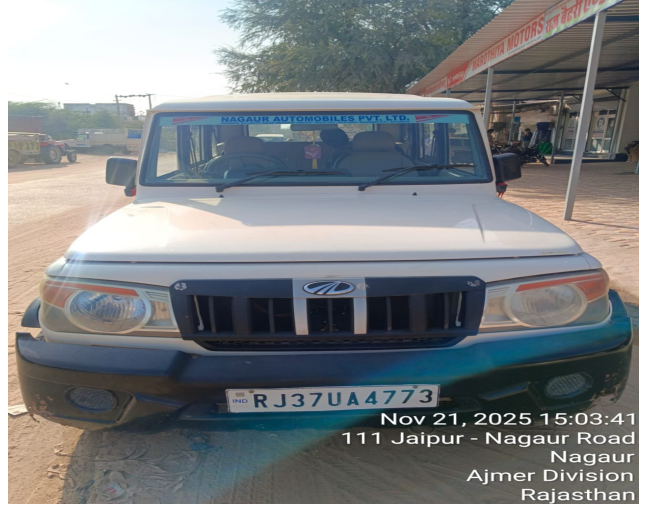
Nov 21, 2025 15:03:41 111 Jaipur - Nagaur Road Nagaur Ajmer Division Rajasthan