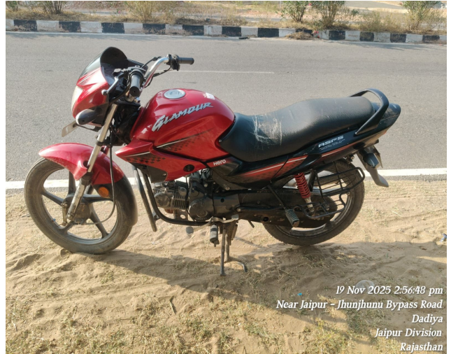
19 Nov 2025 2:56:48 pm Near Jaipur - Jhunjhunu Bypass Road Dadiya Jaipur Division Rajasthan