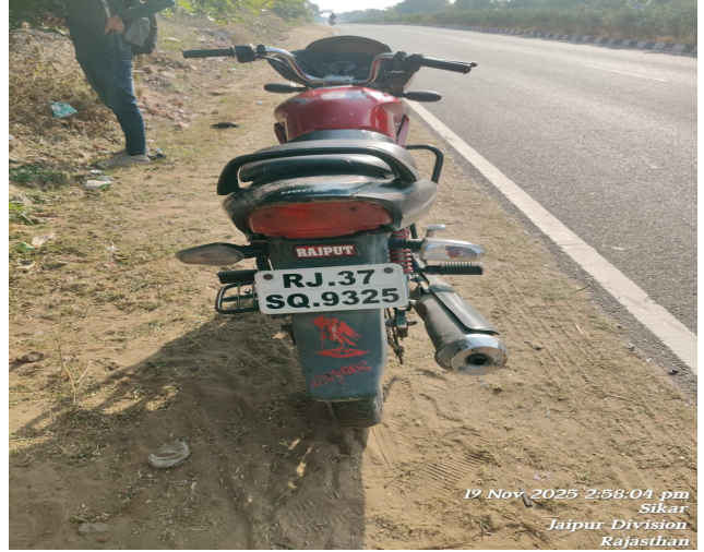
19 Nov 2025 2:58:04 pm Sikar Jaipur Division Rajasthan