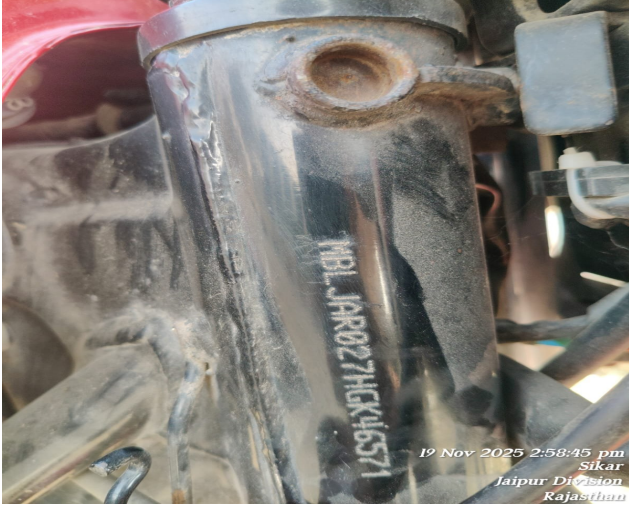
19 Nov 2025 2:58:45 pm Sikar Jaipur Division Rajasthan

Surveyor & Loss Assessor (SLA / 65869 Valid up to 27-09-27)