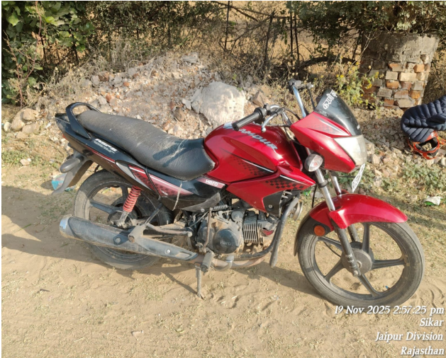
19 Nov 2025 2:57:25 pm Sikar Jaipur Division Rajasthan