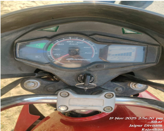
19 Nov 2025 2:56:20 pm Sikar Jaipur Division Rajasthan