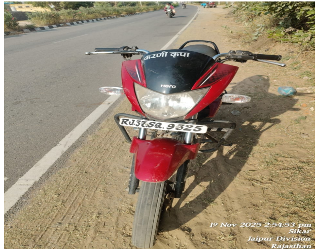
19 Nov 2025 2:54:53 pm Sikar Jaipur Division Rajasthan