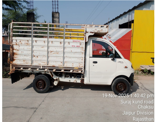
19-Nov-2025 1:40:42 pm Suraj kund road Chaksu Jaipur Division Rajasthan