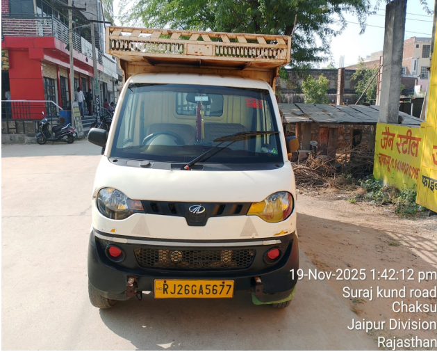
19-Nov-2025 1:42:12 pm Suraj kund road Chaksu Jaipur Division Rajasthan

Surveyor & Loss Assessor (SLA / 65869 Valid up to 27-09-27)