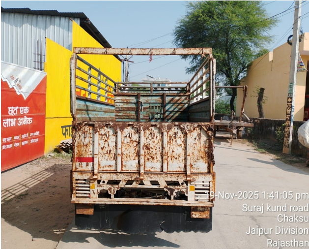
19-Nov-2025 1:41:05 pm Suraj kund road Chaksu Jaipur Division Rajasthan