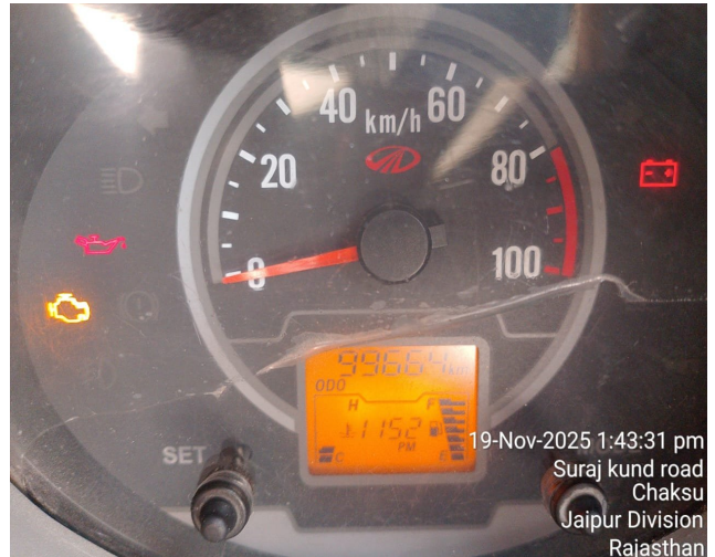
19-Nov-2025 1:43:31 pm Suraj kund road Chaksu Jaipur Division Rajasthan