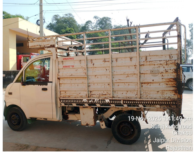
19-Nov-2025 1:41:49 pm Suraj kund road Chaksu Jaipur Division Rajasthan