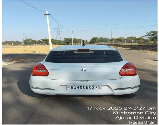
17 Nov 2025 2:43:27 pm Kuchaman City Ajmer Division Rajasthan