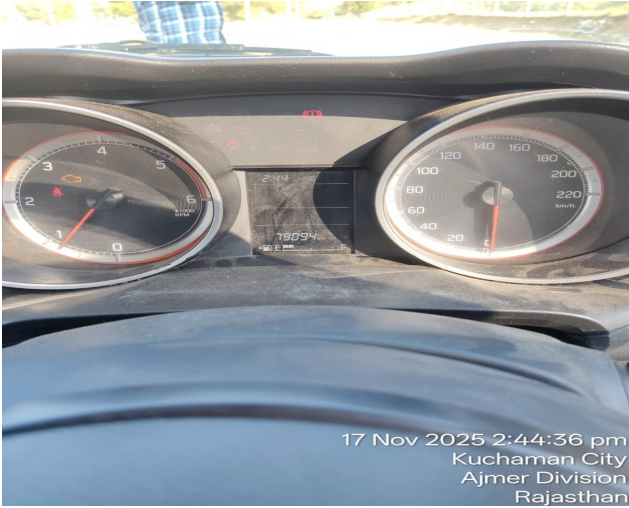
17 Nov 2025 2:44:36 pm Kuchaman City Ajmer Division Rajasthan

Surveyor & Loss Assessor (SLA / 65869 Valid up to 27-09-27)