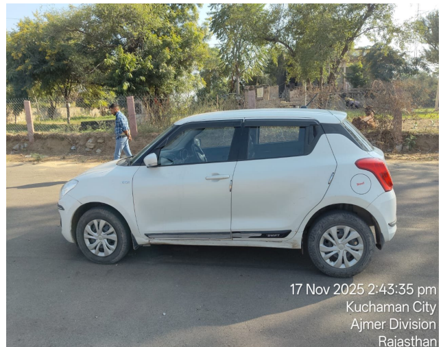
17 Nov 2025 2:43:35 pm Kuchaman City Ajmer Division Rajasthan