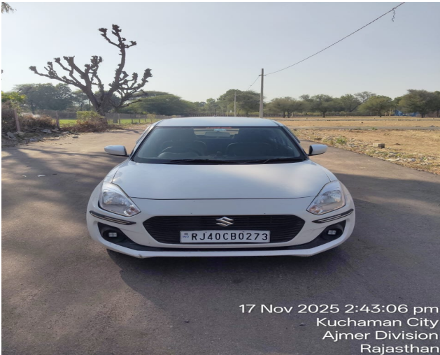
17 Nov 2025 2:43:06 pm Kuchaman City Ajmer Division Rajasthan