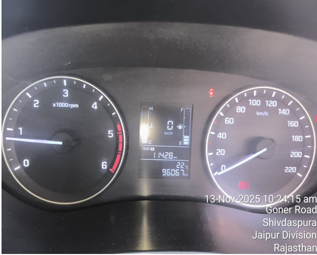
13-Nov-2025 10:24:15 am Goner Road Shivdaspora Jaipur Division Rajasthan

Surveyor & Loss Assessor (SLA / 65869 Valid up to 27-09-27)