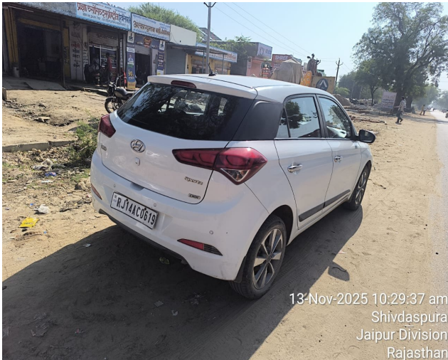
13-Nov-2025 10:29:37 am Shivdaspora Jaipur Division Rajasthan