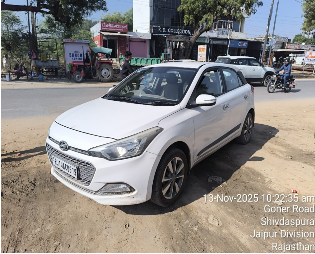
13-Nov-2025 10:22:35 am Goner Road Shivdaspora Jaipur Division Rajasthan