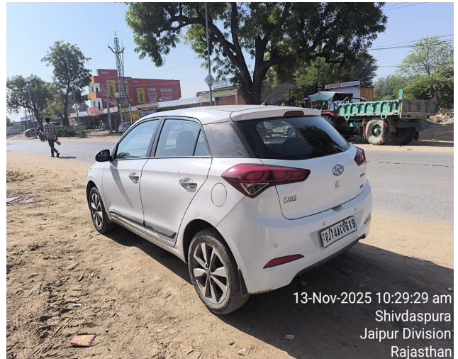
13-Nov-2025 10:29:29 am Shivdaspora Jaipur Division Rajasthan