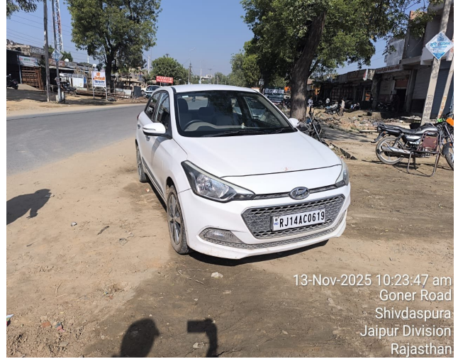
13-Nov-2025 10:23:47 am Goner Road Shivdaspora Jaipur Division Rajasthan