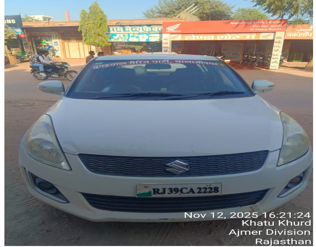
Nov 12, 2025 16:21:24 Khatu Khurd Ajmer Division Rajasthan