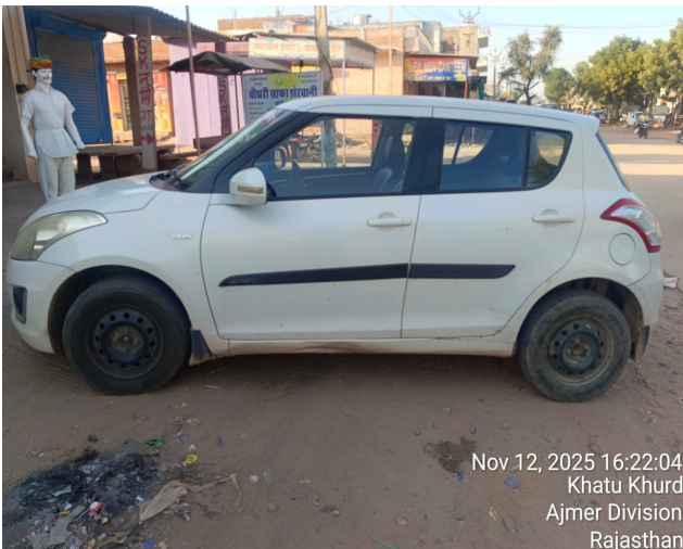
Nov 12, 2025 16:22:04 Khatu Khurd Ajmer Division Rajasthan