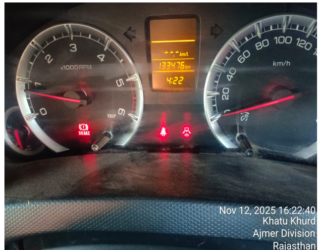
Nov 12, 2025 16:22:40 Khatu Khurd Ajmer Division Rajasthan