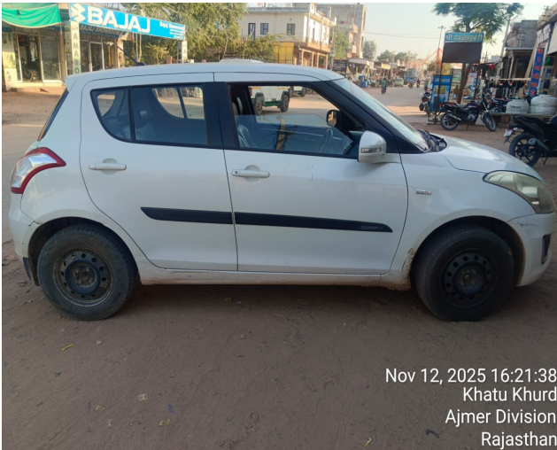
Nov 12, 2025 16:21:38 Khatu Khurd Ajmer Division Rajasthan