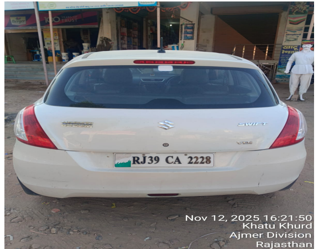
Nov 12, 2025 16:21:50 Khatu Khurd Ajmer Division Rajasthan