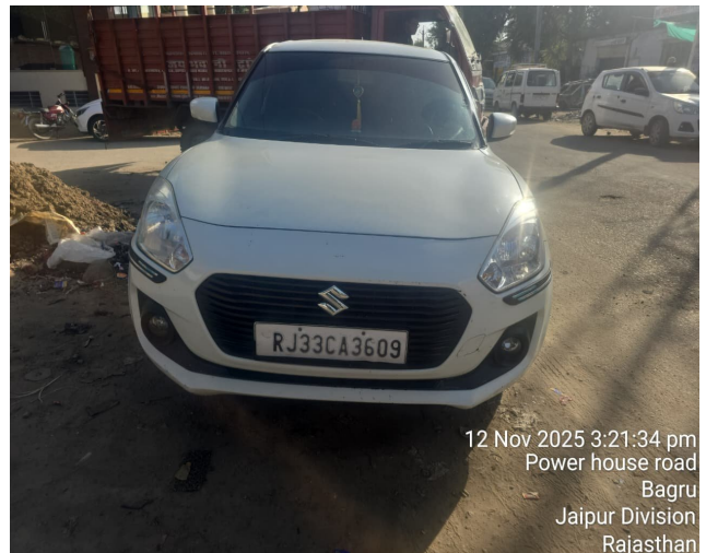
12 Nov 2025 3:21:34 pm Power house road Bagru Jaipur Division Rajasthan