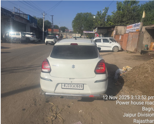
12 Nov 2025 3:13:52 pm Power house road Bagru Jaipur Division Rajasthan