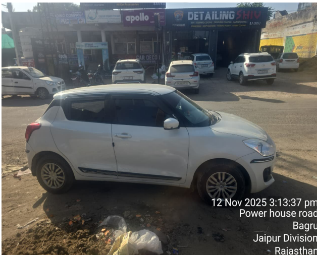
12 Nov 2025 3:13:37 pm Power house road Bagru Jaipur Division Rajasthan