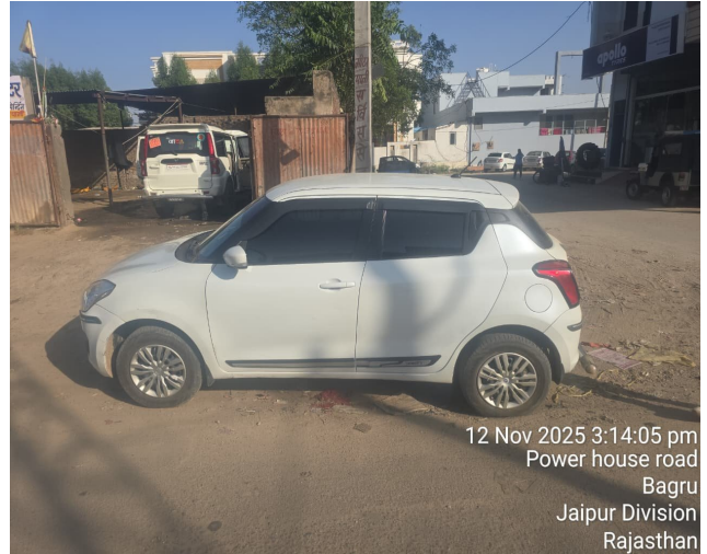
12 Nov 2025 3:14:05 pm Power house road Bagru Jaipur Division Rajasthan