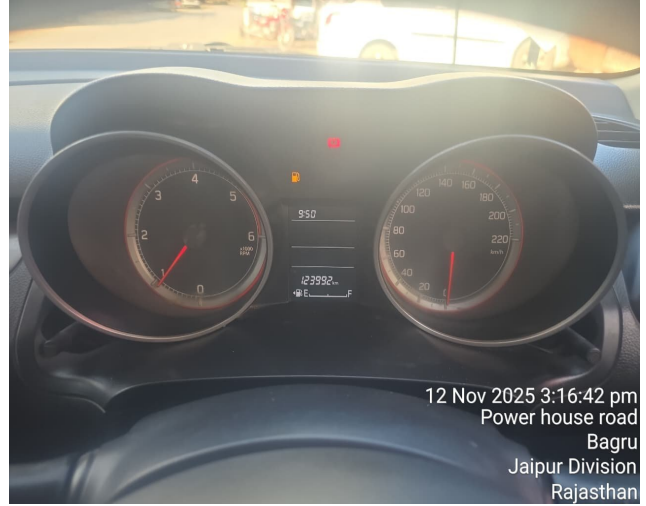
12 Nov 2025 3:16:42 pm Power house road Bagru Jaipur Division Rajasthan