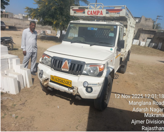
12 Nov 2025 12:01:18 Manglana Road Adarsh Nagar Makrana Ajmer Division Rajasthan

Surveyor & Loss Assessor (SLA / 65869 Valid up to 27-09-27)