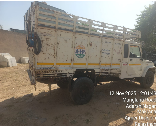
12 Nov 2025 12:01:43 Manglana Road Adarsh Nagar Makrana Ajmer Division Rajasthan