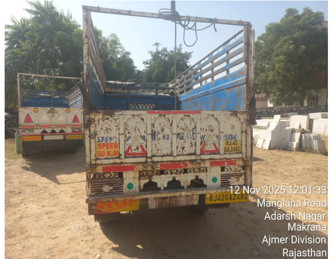
12 Nov 2025 12:01:33 Manglana Road Adarsh Nagar Makrana Ajmer Division Rajasthan