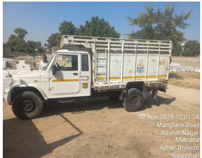
12 Nov 2025 12:01:24 Manglana Road Adarsh Nagar Makrana Ajmer Division Rajasthan