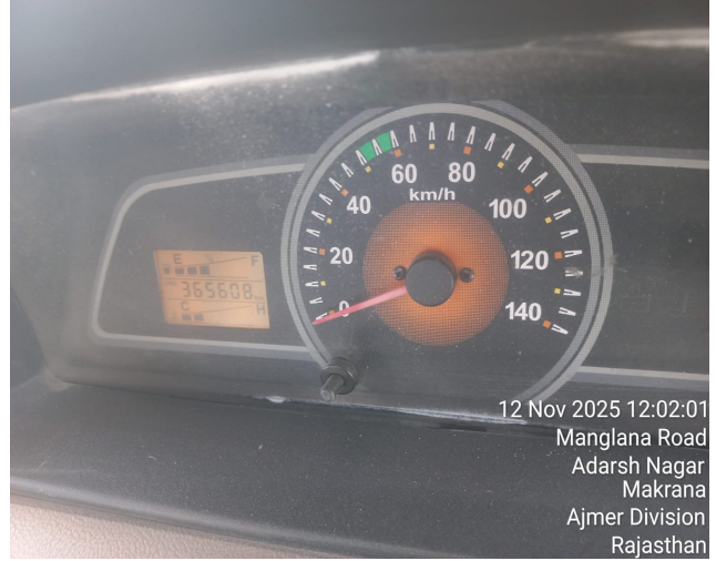
12 Nov 2025 12:02:01 Manglana Road Adarsh Nagar Makrana Ajmer Division Rajasthan