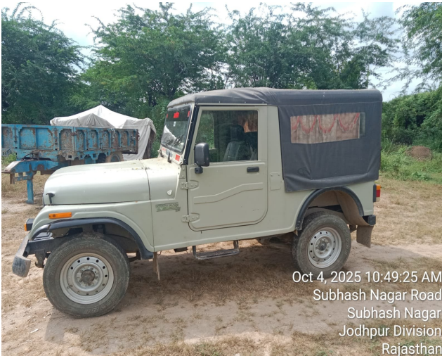
Oct 4, 2025 10:49:25 AM Subhash Nagar Road Subhash Nagar Jodhpur Division Rajasthan