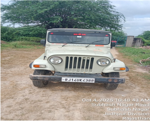
Oct 4, 2025 10:48:43 AM Subhash Nagar Road Subhash Nagar Jodhpur Division Rajasthan