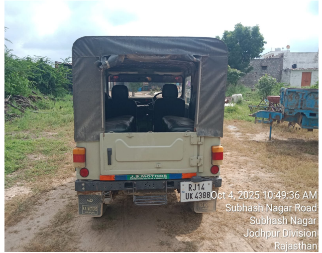
Oct 4, 2025 10:49:36 AM Subhash Nagar Road Subhash Nagar Jodhpur Division Rajasthan