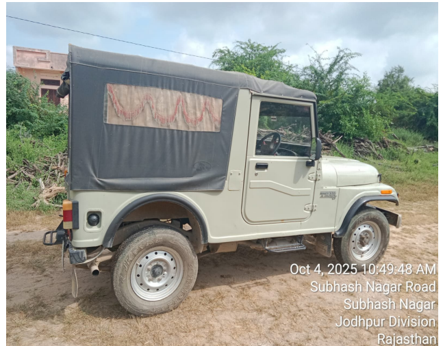
Oct 4, 2025 10:49:48 AM Subhash Nagar Road Subhash Nagar Jodhpur Division Rajasthan