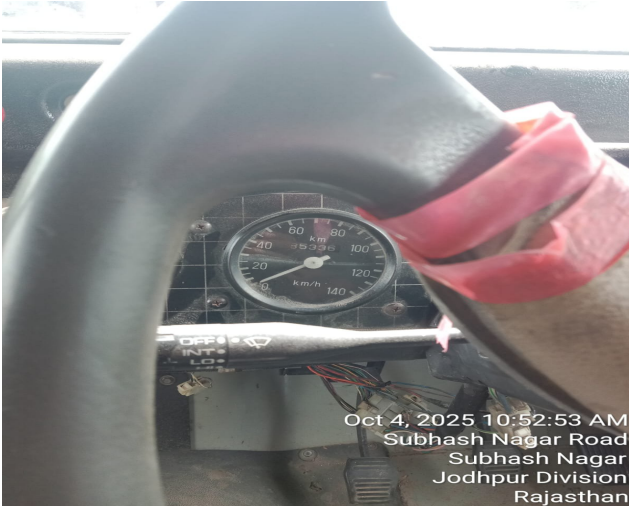
Oct 4, 2025 10:52:53 AM Subhash Nagar Road Subhash Nagar Jodhpur Division Rajasthan

Surveyor & Loss Assessor (SLA / 65869 Valid up to 27-09-27)