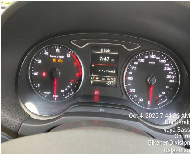
Oct 4, 2025 7:44:26 AM Nai Sarak Naya Bass Churu Bikaner Division Rajasthan