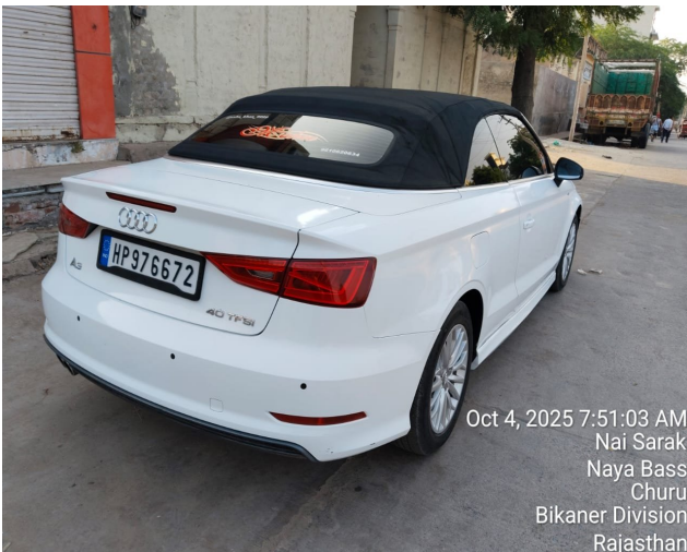
Oct 4, 2025 7:51:03 AM Nai Sarak Naya Bass Churu Bikaner Division Rajasthan