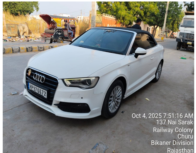
Oct 4, 2025 7:51:16 AM 137 Nai Sarak Railway Colony Churu Bikaner Division Rajasthan