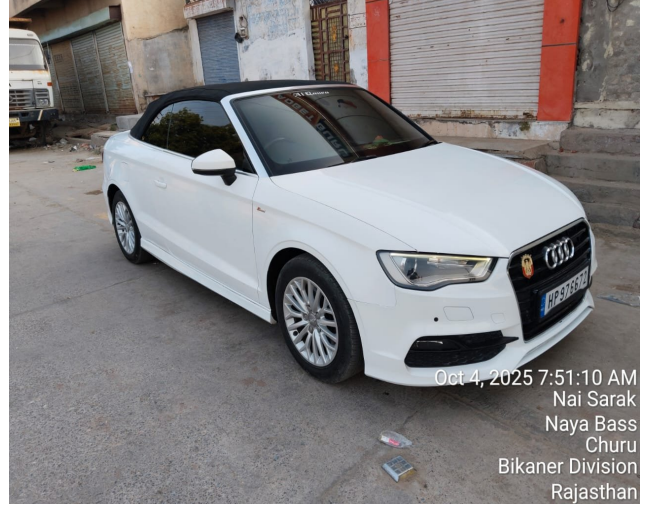
Oct 4, 2025 7:51:10 AM Nai Sarak Naya Bass Churu Bikaner Division Rajasthan