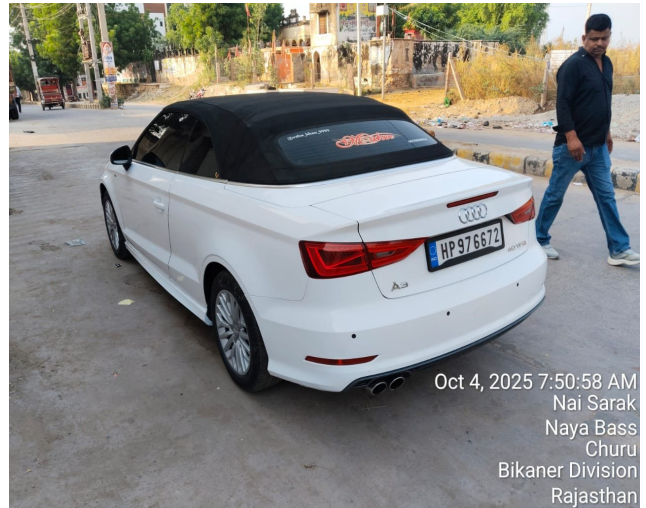
Oct 4, 2025 7:50:58 AM Nai Sarak Naya Bass Churu Bikaner Division Rajasthan