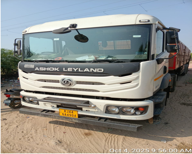
Oct 4, 2025 9:56:00 AM

Surveyor & Loss Assessor (SLA / 65869 Valid up to 27-09-27)