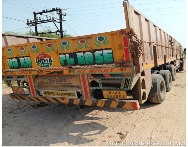
Oct 4, 2025 9:56:39 AM