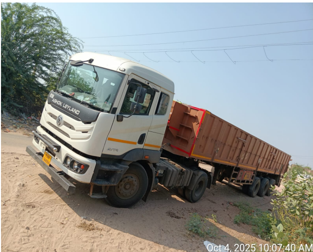
Oct 4, 2025 10:07:40 AM