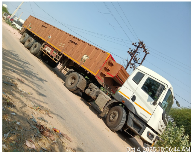
Oct 4, 2025 10:06:44 AM