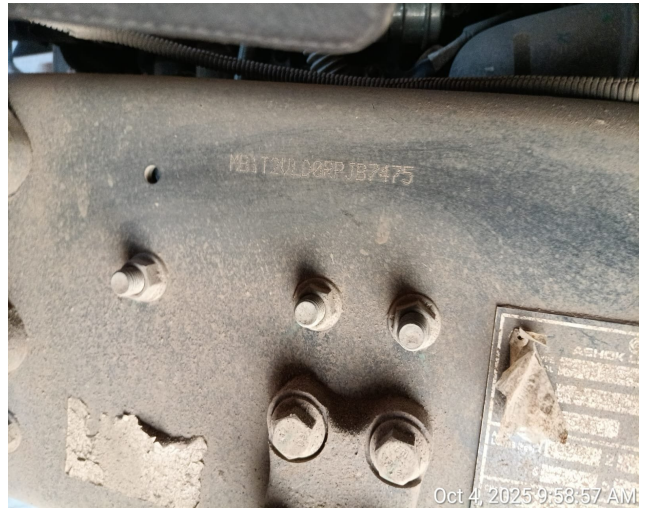
Oct 4, 2025 9:58:57 AM