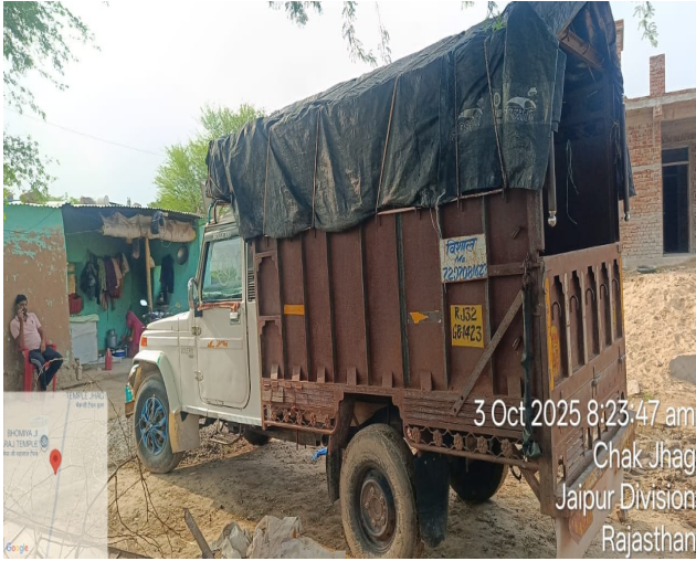
3 Oct 2025 8:23:47 am Chak Jhag Jaipur Division Rajasthan

Surveyor & Loss Assessor (SLA / 65869 Valid up to 27-09-27)