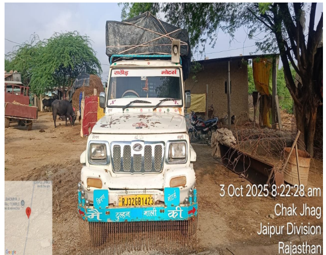
3 Oct 2025 8:22:28 am Chak Jhag Jaipur Division Rajasthan