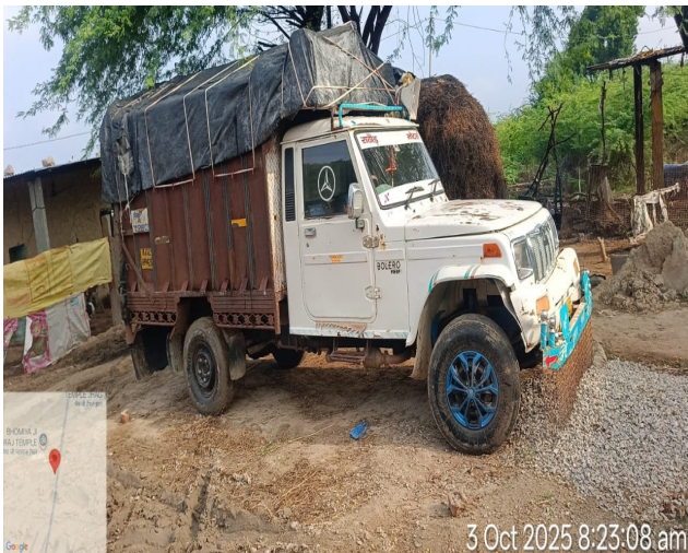
3 Oct 2025 8:23:08 am