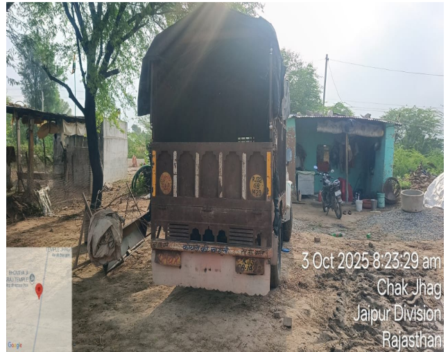
3 Oct 2025 8:23:29 am Chak Jhag Jaipur Division Rajasthan