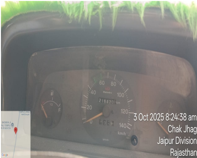
3 Oct 2025 8:24:38 am Chak Jhag Jaipur Division Rajasthan