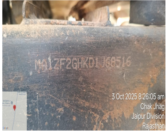
3 Oct 2025 8:26:05 am Chak Jhag Jaipur Division Rajasthan