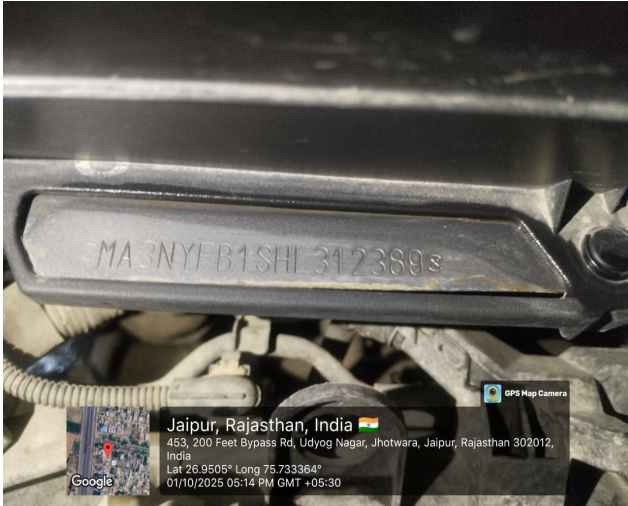
Jaipur, Rajasthan, India 453, 200 Feet Bypass Rd, Udyog Nagar, Jhotwara, Jaipur, Rajasthan 302012, India Lat 26.9505° Long 75.733364° 01/10/2025 05:14 PM GMT +05:30

Surveyor & Loss Assessor (SLA / 65869 Valid up to 27-09-27)