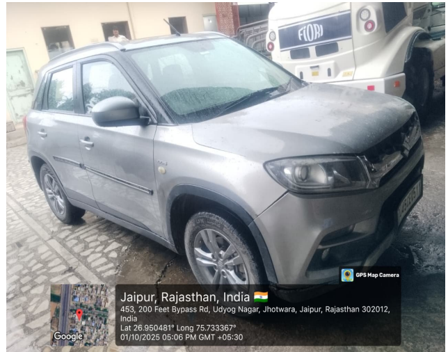
Jaipur, Rajasthan, India 453, 200 Feet Bypass Rd, Udyog Nagar, Jhotwara, Jaipur, Rajasthan 302012, India Lat 26.950481° Long 75.733367° 01/10/2025 05:06 PM GMT +05:30