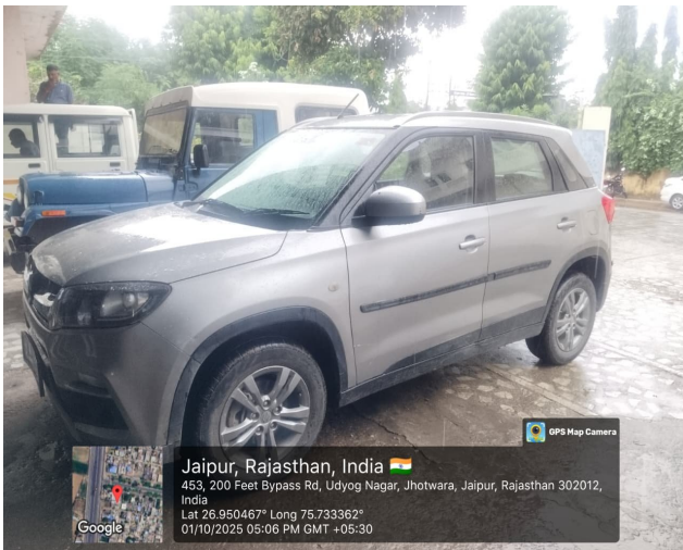
Jaipur, Rajasthan, India 453, 200 Feet Bypass Rd, Udyog Nagar, Jhotwara, Jaipur, Rajasthan 302012, India Lat 26.950467° Long 75.733362° 01/10/2025 05:06 PM GMT +05:30