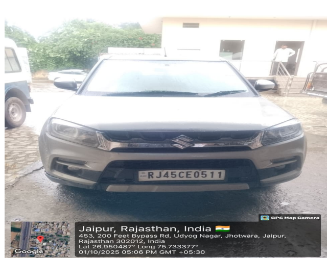
Jaipur, Rajasthan, India 453, 200 Feet Bypass Rd, Udyog Nagar, Jhotwara, Jaipur, Rajasthan 302012, India Lat 26.950487° Long 75.733377° 01/10/2025 05:06 PM GMT +05:30