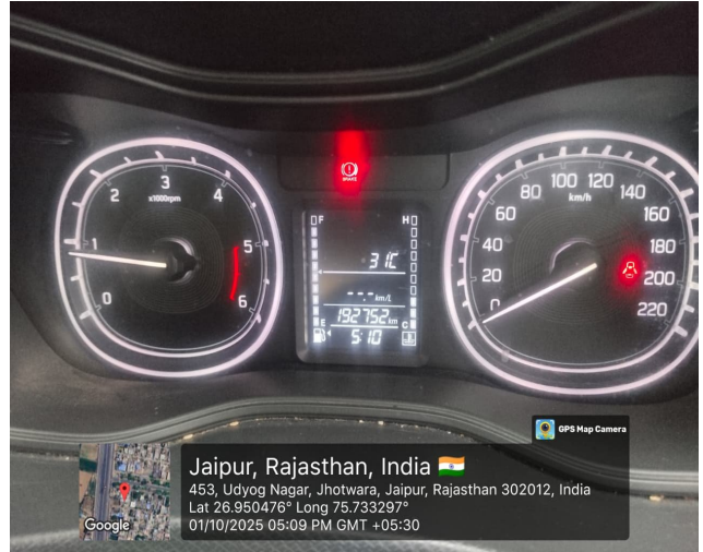
Jaipur, Rajasthan, India 453, Udyog Nagar, Jhotwara, Jaipur, Rajasthan 302012, India Lat 26.950476° Long 75.733297° 01/10/2025 05:09 PM GMT +05:30