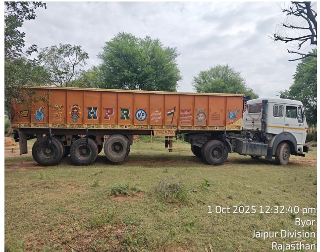
1 Oct 2025 12:32:40 pm Byor Jaipur Division Rajasthan