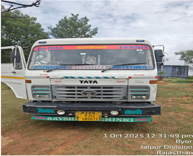
1 Oct 2025 12:31:49 pm Byor Jaipur Division Rajasthan

Surveyor & Loss Assessor (SLA / 65869 Valid up to 27-09-27)