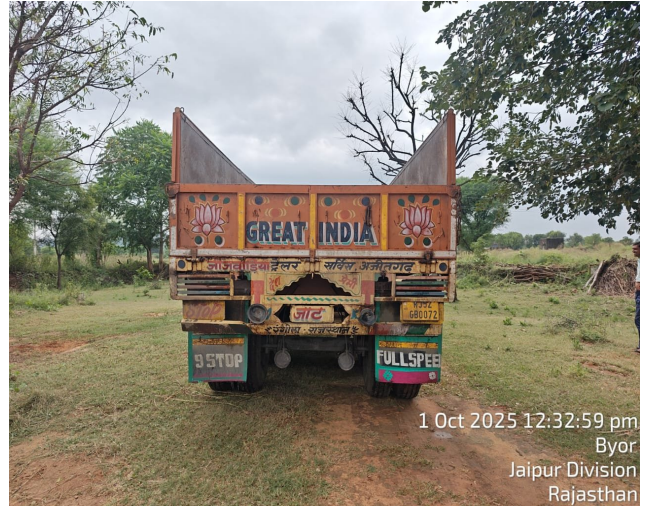
1 Oct 2025 12:32:59 pm Byor Jaipur Division Rajasthan