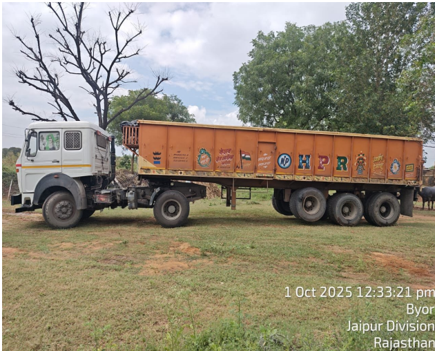
1 Oct 2025 12:33:21 pm Byor Jaipur Division Rajasthan