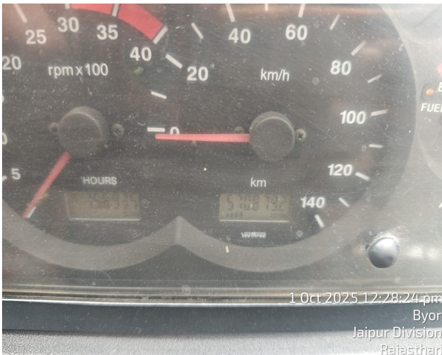
1 Oct 2025 12:28:24 pm Byor Jaipur Division Rajasthan