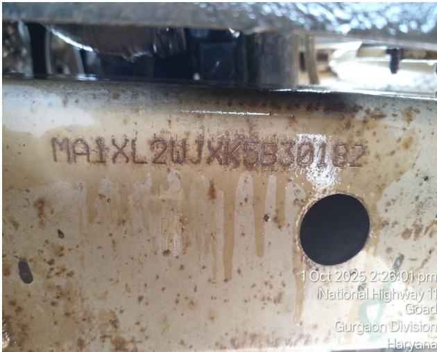
1 Oct 2025 2:26:01 pm National Highway 11 Goa Gurgaon Division Haryana