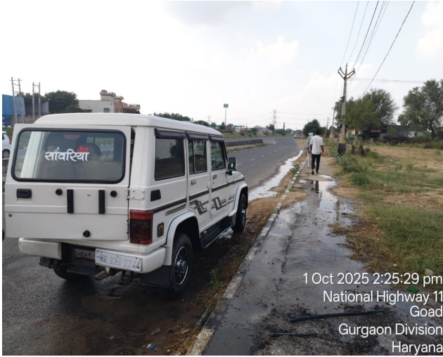
1 Oct 2025 2:25:29 pm National Highway 11 Goa Gurgaon Division Haryana

Surveyor & Loss Assessor (SLA / 65869 Valid up to 27-09-27)