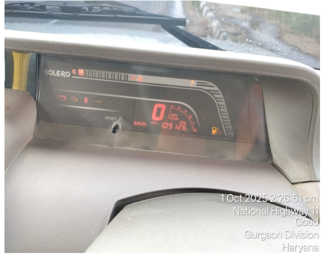
1 Oct 2025 2:26:51 pm National Highway 11 Goa Gurgaon Division Haryana