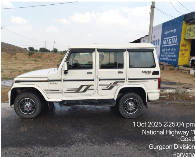
1 Oct 2025 2:25:04 pm National Highway 11 Goa Gurgaon Division Haryana