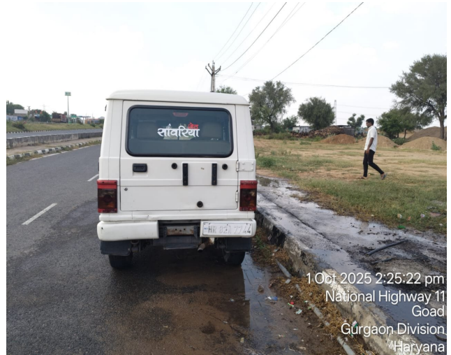
1 Oct 2025 2:25:22 pm National Highway 11 Goa Gurgaon Division Haryana