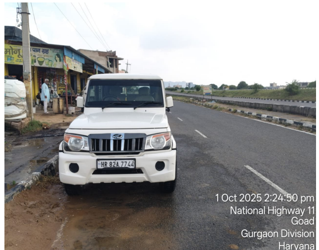
1 Oct 2025 2:24:50 pm National Highway 11 Goa Gurgaon Division Haryana