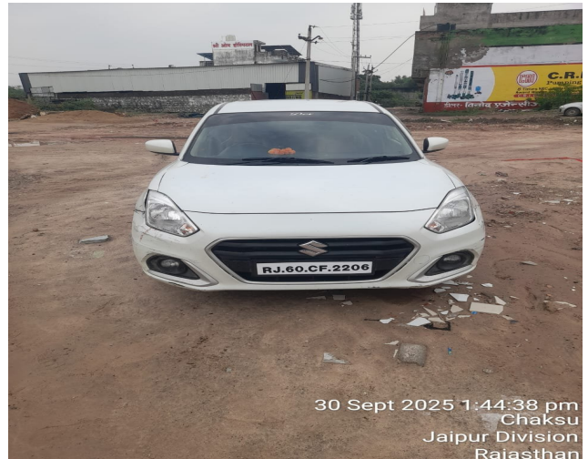
30 Sept 2025 1:44:38 pm Chaksu Jaipur Division Rajasthan