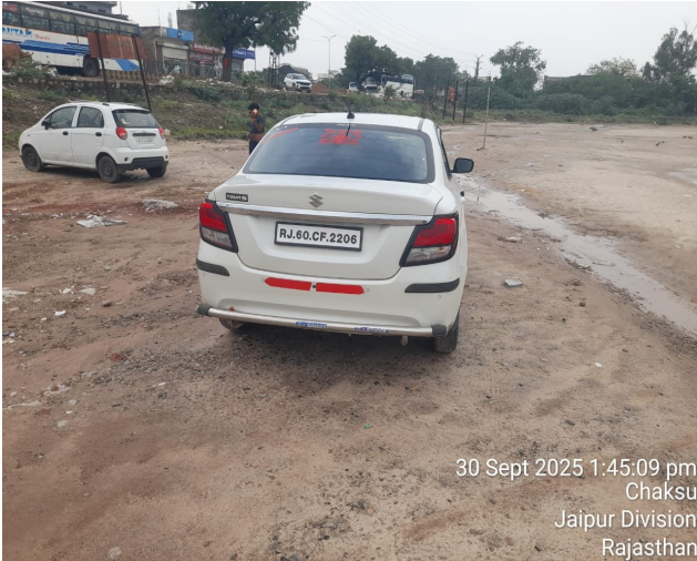
30 Sept 2025 1:45:09 pm Chaksu Jaipur Division Rajasthan