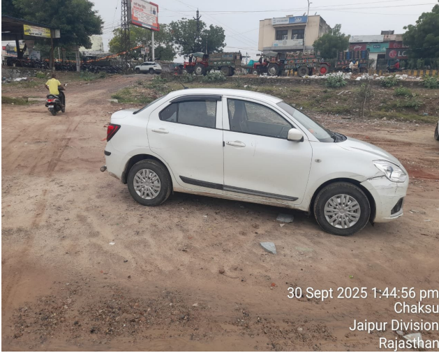
30 Sept 2025 1:44:56 pm Chaksu Jaipur Division Rajasthan

Surveyor & Loss Assessor (SLA / 65869 Valid up to 27-09-27)