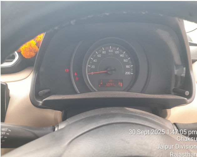
30 Sept 2025 1:47:05 pm Chaksu Jaipur Division Rajasthan