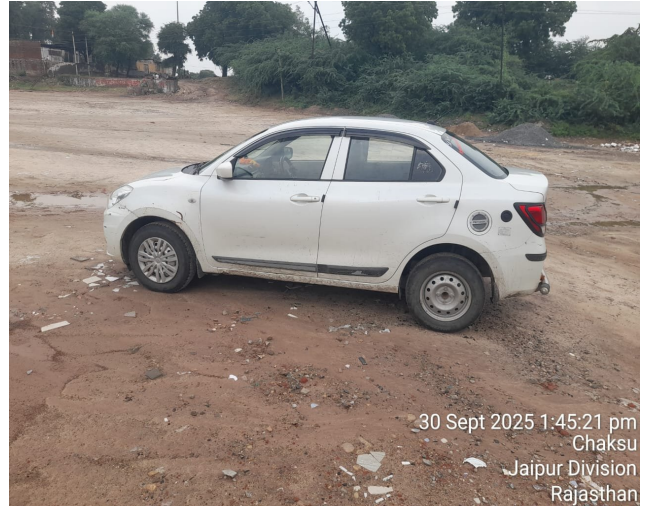
30 Sept 2025 1:45:21 pm Chaksu Jaipur Division Rajasthan