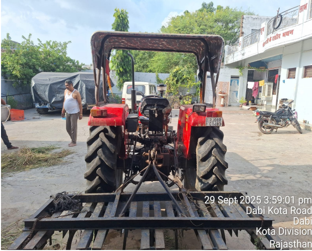
29 Sept 2025 3:59:01 pm Dabi Kota Road Dabi Kota Division Rajasthan

Surveyor & Loss Assessor (SLA / 65869 Valid up to 27-09-27)