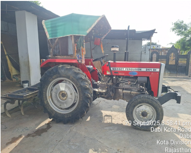
29 Sept 2025 3:58:41 pm Dabi Kota Road Dabi Kota Division Rajasthan