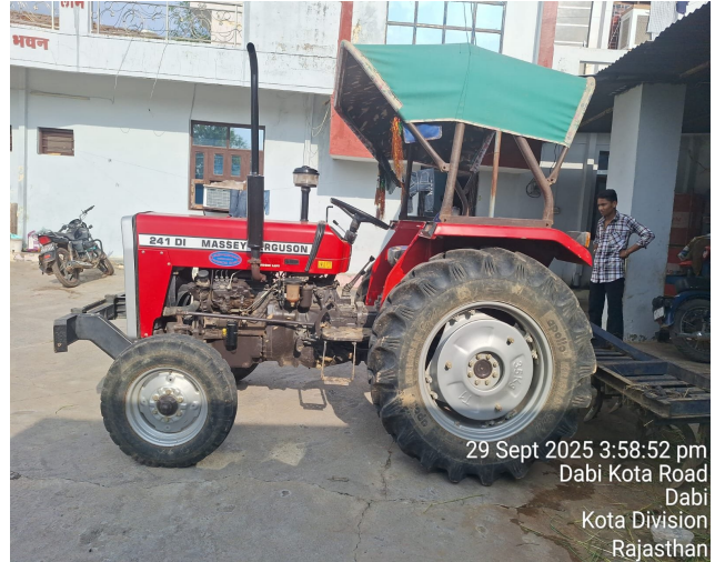
29 Sept 2025 3:58:52 pm Dabi Kota Road Dabi Kota Division Rajasthan