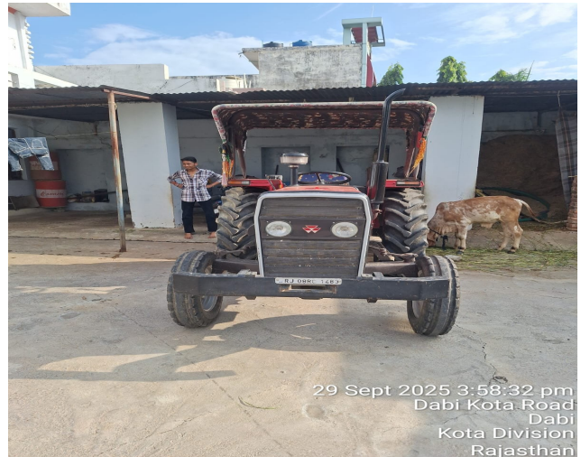
29 Sept 2025 3:58:32 pm Dabi Kota Road Dabi Kota Division Rajasthan