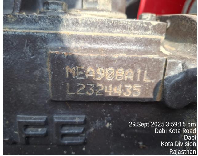
29 Sept 2025 3:59:15 pm Dabi Kota Road Dabi Kota Division Rajasthan