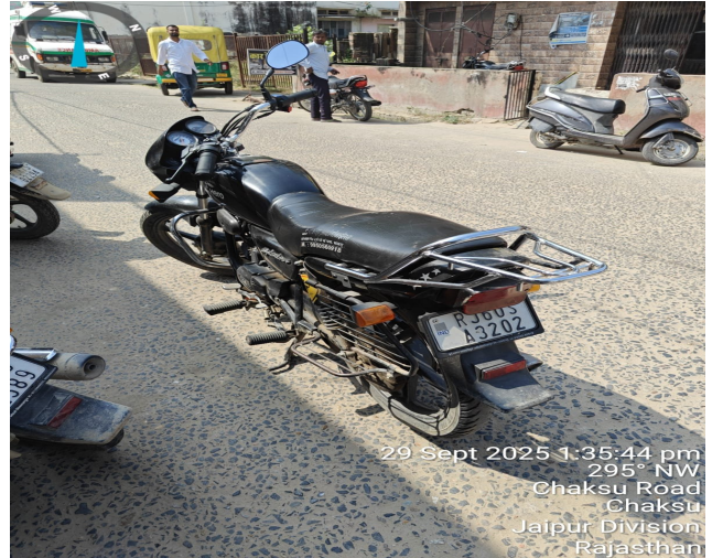
29 Sept 2025 1:35:44 pm 295° NW Chaksu Road Chaksu Jaipur Division Rajasthan