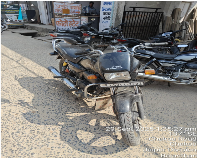
29 Sept 2025 1:35:27 pm 137° SE Chaksu Road Chaksu Jaipur Division Rajasthan