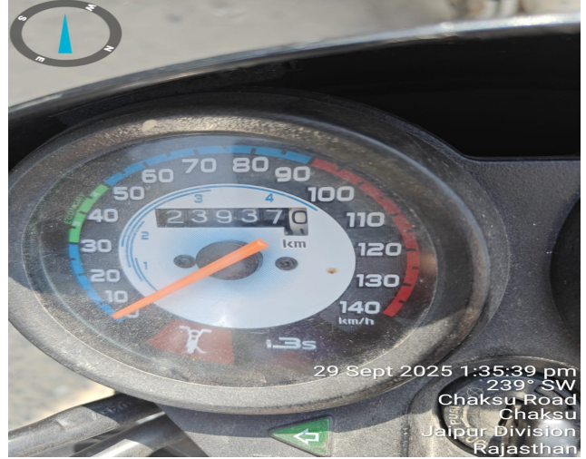
29 Sept 2025 1:35:39 pm 239° SW Chaksu Road Chaksu Jaipur Division Rajasthan