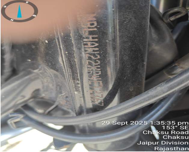
29 Sept 2025 1:35:35 pm 153° SE Chaksu Road Chaksu Jaipur Division Rajasthan

Surveyor & Loss Assessor (SLA / 65869 Valid up to 27-09-27)