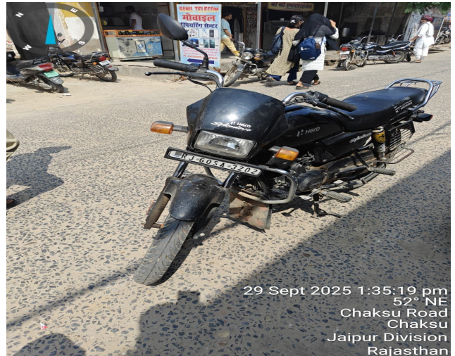
29 Sept 2025 1:35:19 pm 52° NE Chaksu Road Chaksu Jaipur Division Rajasthan