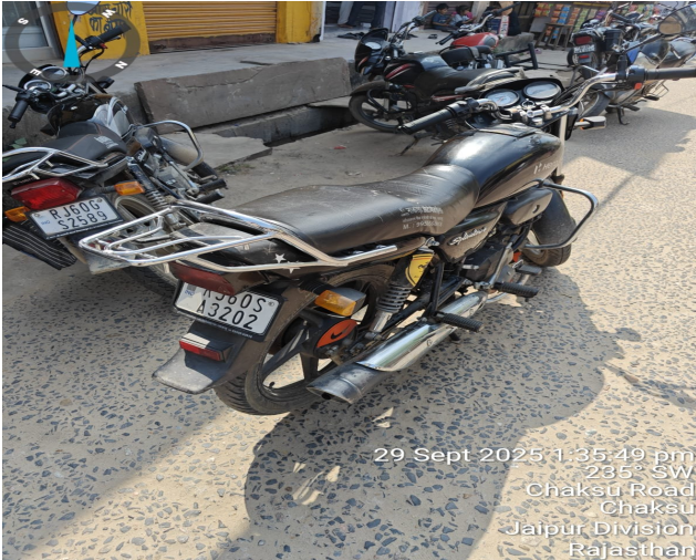
29 Sept 2025 1:35:49 pm 235° SW Chaksu Road Chaksu Jaipur Division Rajasthan