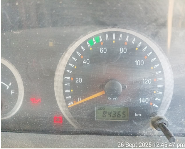
26-Sept-2025 12:45:47 pm

Surveyor & Loss Assessor (SLA / 65869 Valid up to 27-09-27)