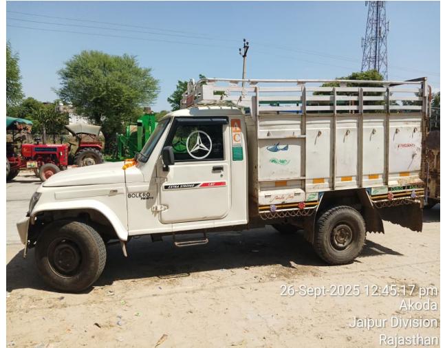
26-Sept-2025 12:45:17 pm Akoda Jaipur Division Rajasthan