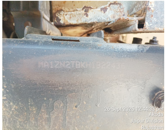
26-Sept-2025 12:44:33 pm Akoda Jaipur Division Rajasthan