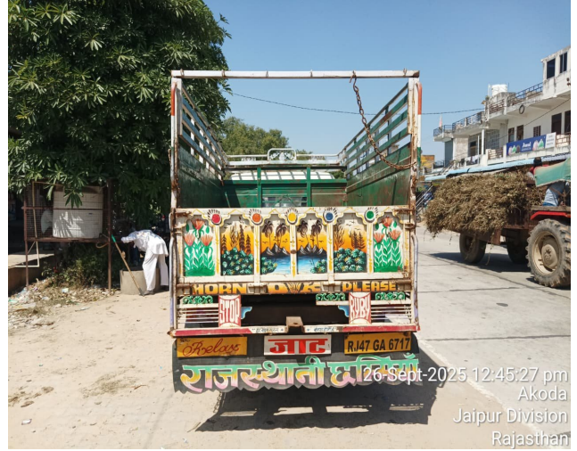
26-Sept-2025 12:45:27 pm Akoda Jaipur Division Rajasthan