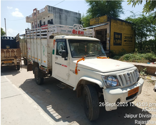
26-Sept-2025 12:45:05 pm Akoda Jaipur Division Rajasthan