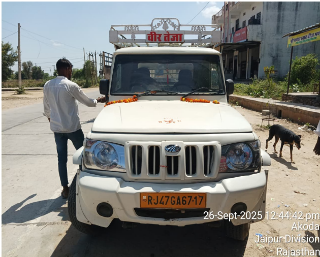
26-Sept-2025 12:44:42 pm Akoda Jaipur Division Rajasthan