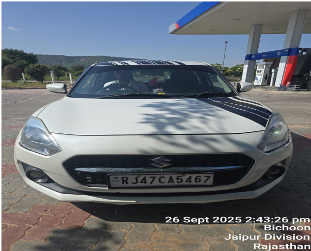
26 Sept 2025 2:43:26 pm Bichoon Jaipur Division Rajasthan