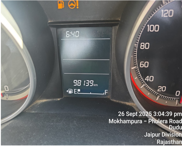
26 Sept 2025 3:04:39 pm Mokhampura - Phulera Road Dudu Jaipur Division Rajasthan

Surveyor & Loss Assessor (SLA / 65869 Valid up to 27-09-27)