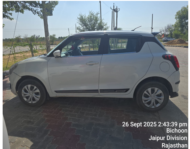
26 Sept 2025 2:43:39 pm Bichoon Jaipur Division Rajasthan