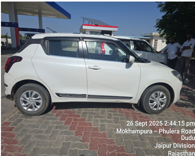
26 Sept 2025 2:44:15 pm Mokhampura - Phulera Road Dudu Jaipur Division Rajasthan