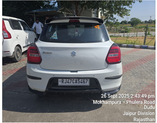
26 Sept 2025 2:43:49 pm Mokhampura - Phulera Road Dudu Jaipur Division Rajasthan