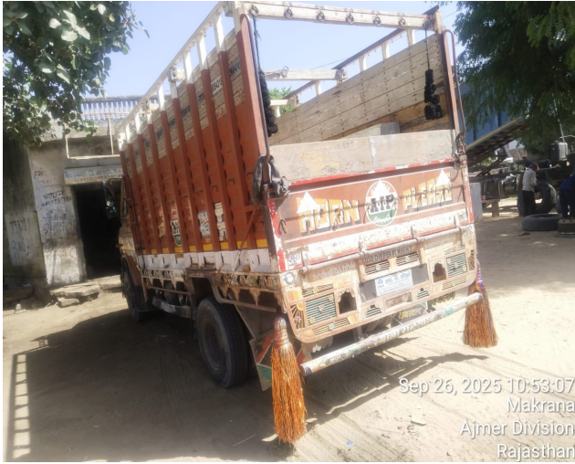
Sep 26, 2025 10:53:07 Makrana Ajmer Division Rajasthan