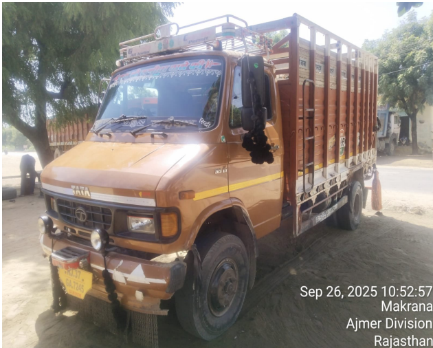
Sep 26, 2025 10:52:57 Makrana Ajmer Division Rajasthan