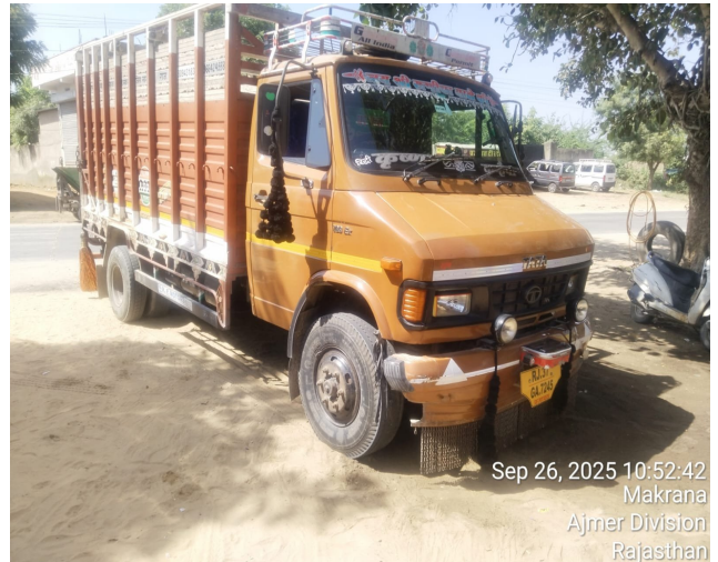
Sep 26, 2025 10:52:42 Makrana Ajmer Division Rajasthan