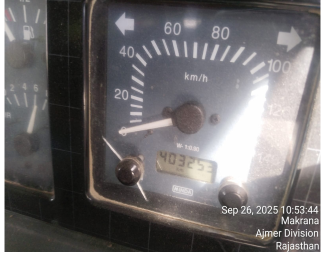
Sep 26, 2025 10:53:44 Makrana Ajmer Division Rajasthan