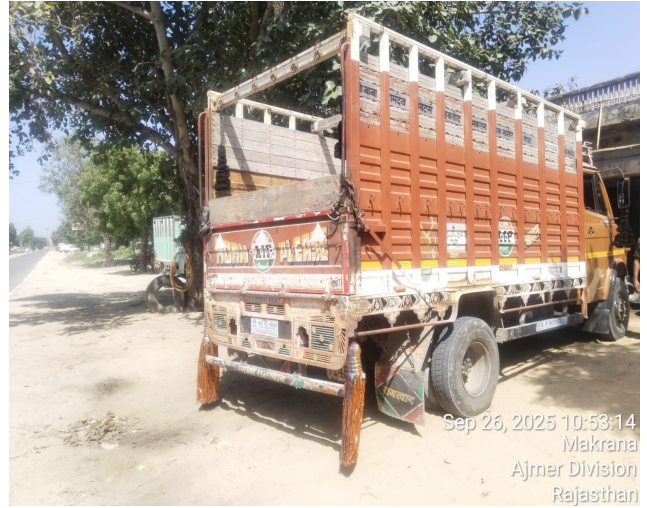
Sep 26, 2025 10:53:14 Makrana Ajmer Division Rajasthan