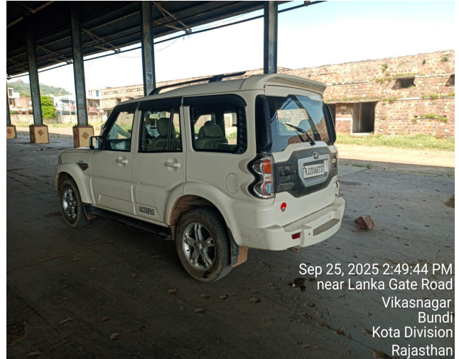
Sep 25, 2025 2:49:44 PM near Lanka Gate Road Vikasnagar Bundi Kota Division Rajasthan