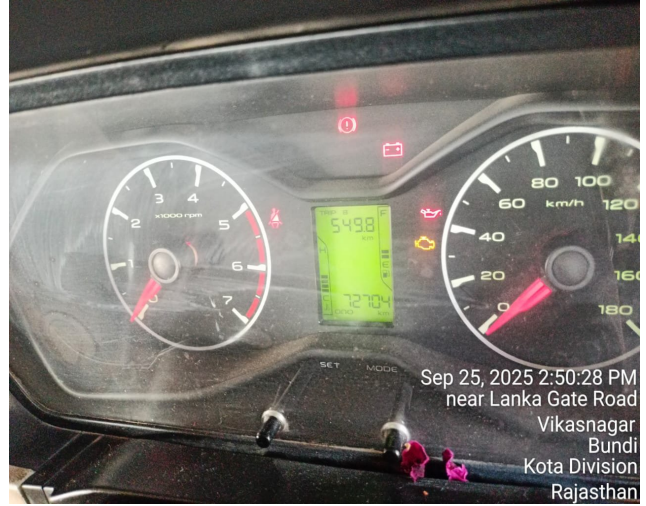
Sep 25, 2025 2:50:28 PM near Lanka Gate Road Vikasnagar Bundi Kota Division Rajasthan