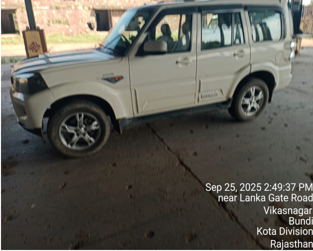
Sep 25, 2025 2:49:37 PM near Lanka Gate Road Vikasnagar Bundi Kota Division Rajasthan

Surveyor & Loss Assessor (SLA / 65869 Valid up to 27-09-27)