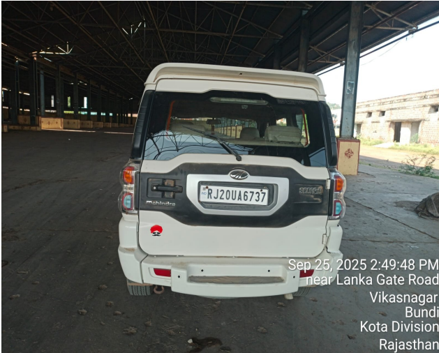
Sep 25, 2025 2:49:48 PM near Lanka Gate Road Vikasnagar Bundi Kota Division Rajasthan