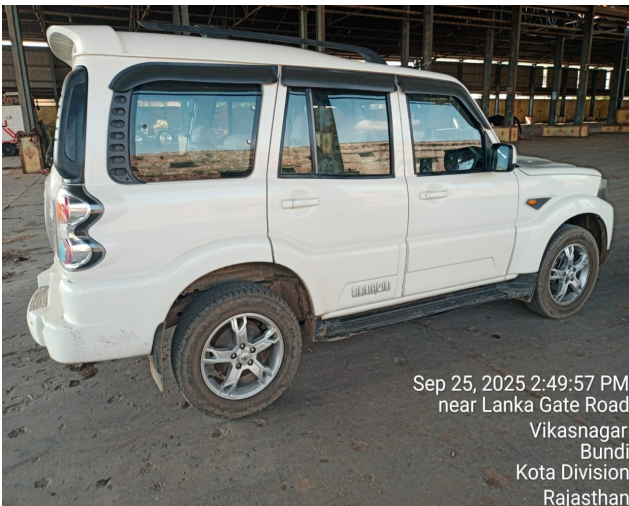
Sep 25, 2025 2:49:57 PM near Lanka Gate Road Vikasnagar Bundi Kota Division Rajasthan