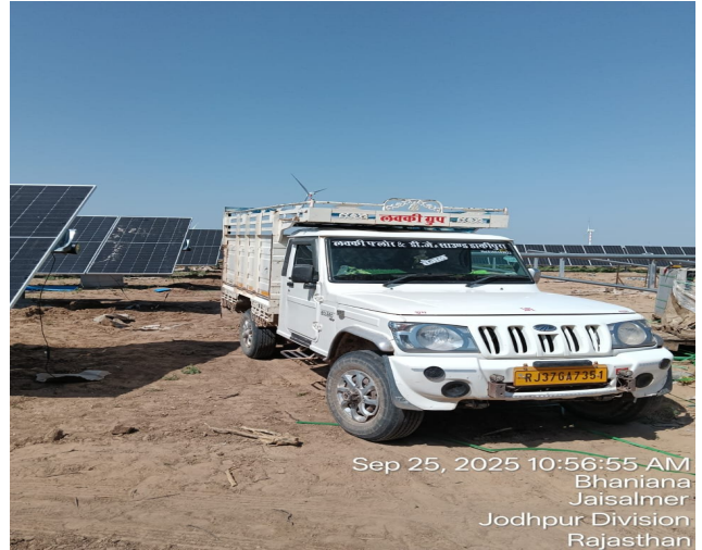
Sep 25, 2025 10:56:55 AM Bhaniana Jaisalmer Jodhpur Division Rajasthan