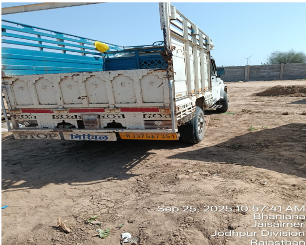
Sep 25, 2025 10:57:41 AM Bhaniana Jaisalmer Jodhpur Division Rajasthan