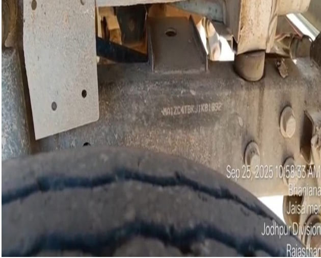
Sep 25, 2025 10:58:33 AM Bhaniana Jaisalmer Jodhpur Division Rajasthan

Surveyor & Loss Assessor (SLA / 65869 Valid up to 27-09-27)