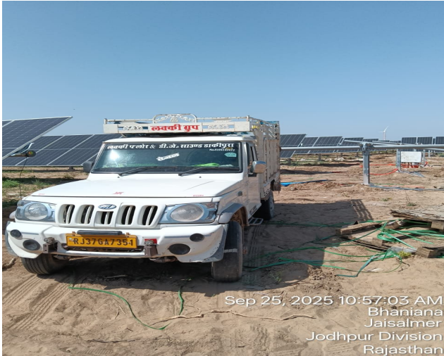
Sep 25, 2025 10:57:03 AM Bhaniana Jaisalmer Jodhpur Division Rajasthan