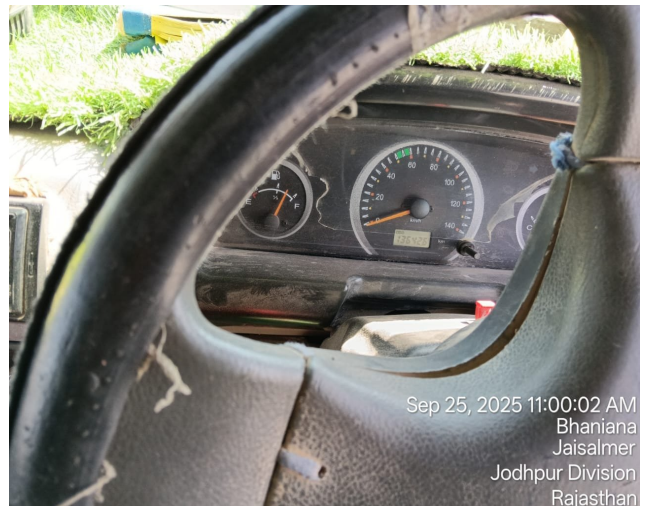
Sep 25, 2025 11:00:02 AM Bhaniana Jaisalmer Jodhpur Division Rajasthan