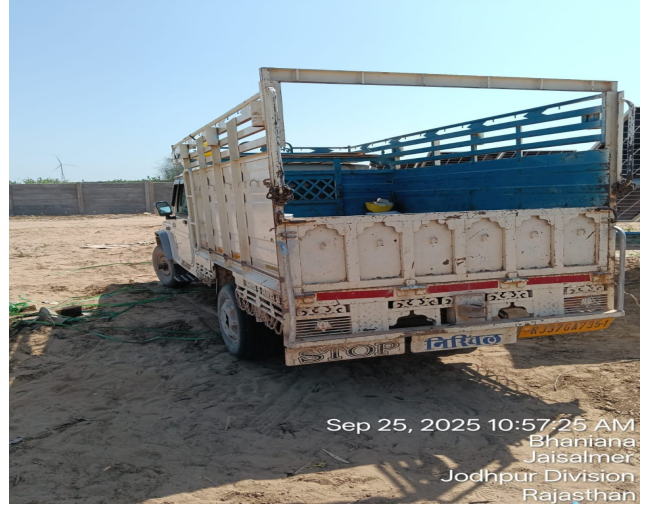
Sep 25, 2025 10:57:25 AM Bhaniana Jaisalmer Jodhpur Division Rajasthan