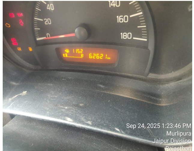
Sep 24, 2025 1:23:46 PM Murlipura Jaipur Division Rajasthan