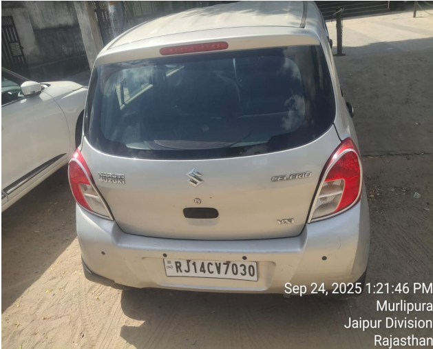
Sep 24, 2025 1:21:46 PM Murlipura Jaipur Division Rajasthan