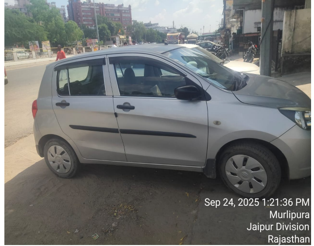
Sep 24, 2025 1:21:36 PM Murlipura Jaipur Division Rajasthan