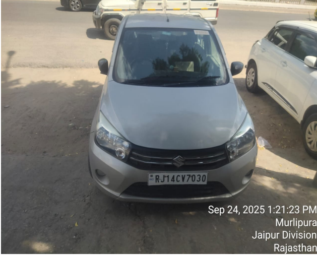
Sep 24, 2025 1:21:23 PM Murlipura Jaipur Division Rajasthan

Surveyor & Loss Assessor (SLA / 65869 Valid up to 27-09-27)