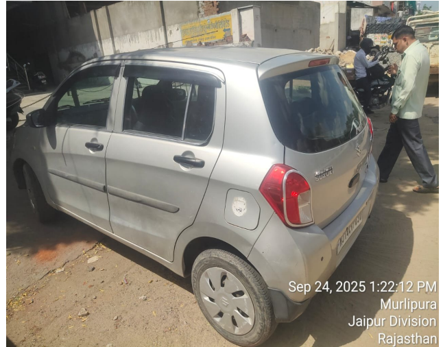
Sep 24, 2025 1:22:12 PM Murlipura Jaipur Division Rajasthan