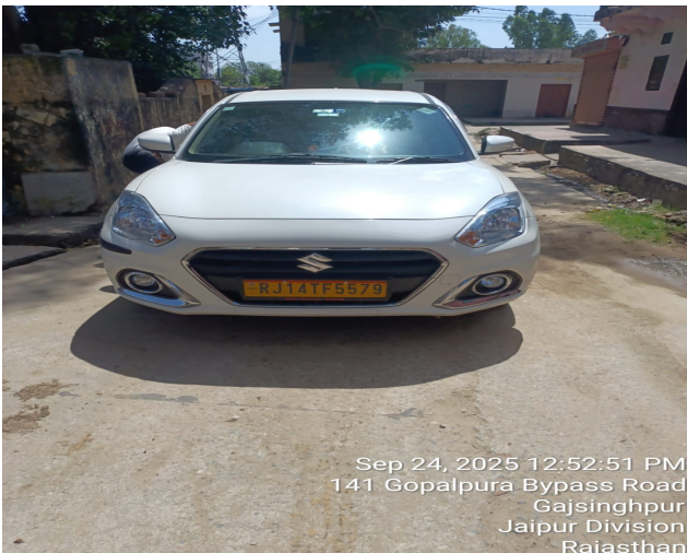
Sep 24, 2025 12:52:51 PM 141 Gopalpura Bypass Road Gajsinghpur Jaipur Division Rajasthan