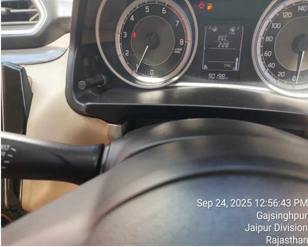
Sep 24, 2025 12:56:43 PM Gajsinghpur Jaipur Division Rajasthan

Surveyor & Loss Assessor (SLA / 65869 Valid up to 27-09-27)