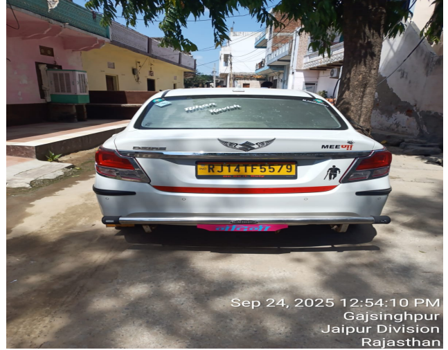
Sep 24, 2025 12:54:10 PM Gajsinghpur Jaipur Division Rajasthan