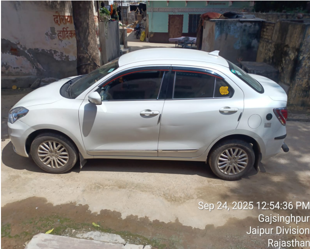
Sep 24, 2025 12:54:36 PM Gajsinghpur Jaipur Division Rajasthan