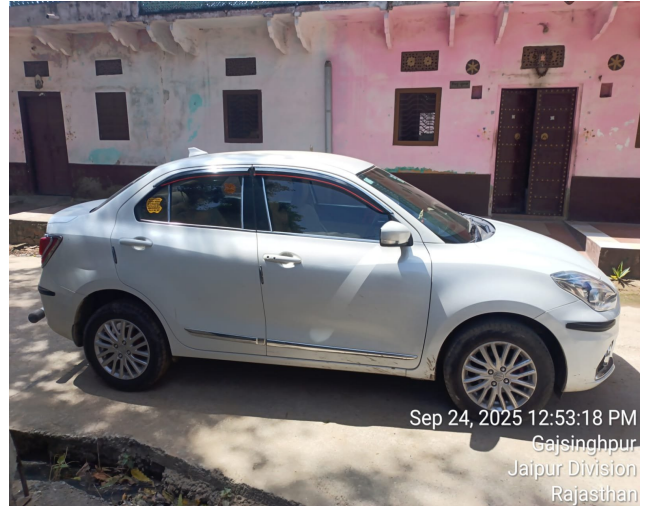
Sep 24, 2025 12:53:18 PM Gajsinghpur Jaipur Division Rajasthan