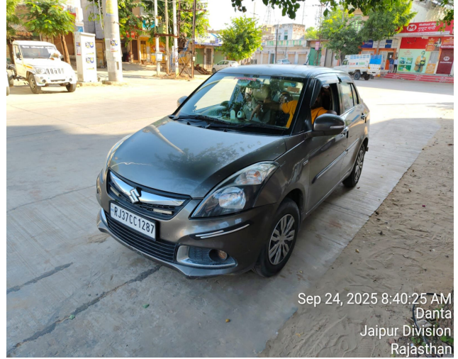
Sep 24, 2025 8:40:25 AM Danta Jaipur Division Rajasthan