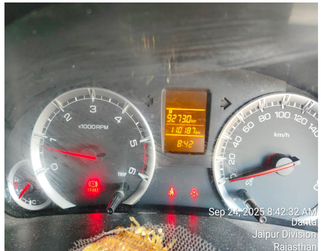
Sep 24, 2025 8:42:32 AM Danta Jaipur Division Rajasthan