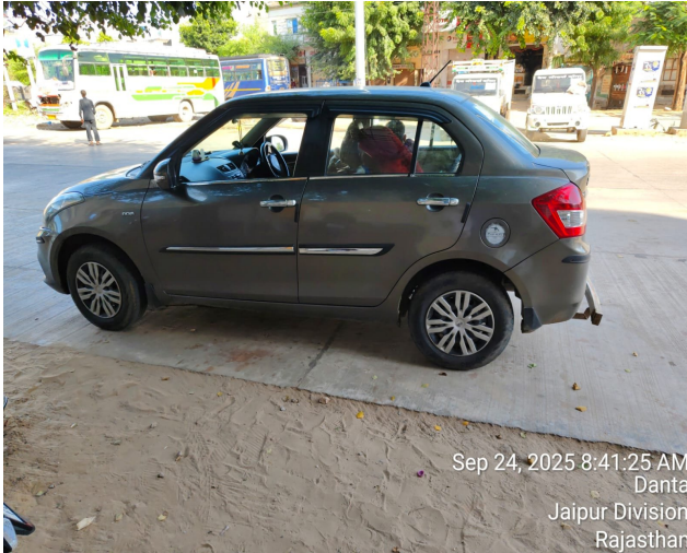
Sep 24, 2025 8:41:25 AM Danta Jaipur Division Rajasthan