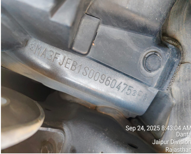
Sep 24, 2025 8:43:04 AM Danta Jaipur Division Rajasthan

Surveyor & Loss Assessor (SLA / 65869 Valid up to 27-09-27)