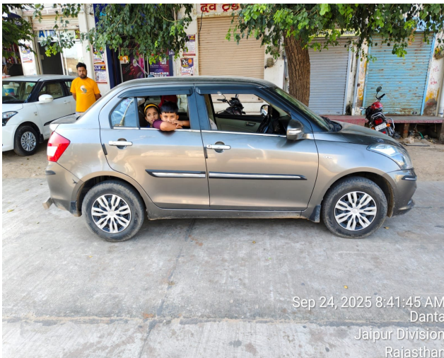
Sep 24, 2025 8:41:45 AM Danta Jaipur Division Rajasthan