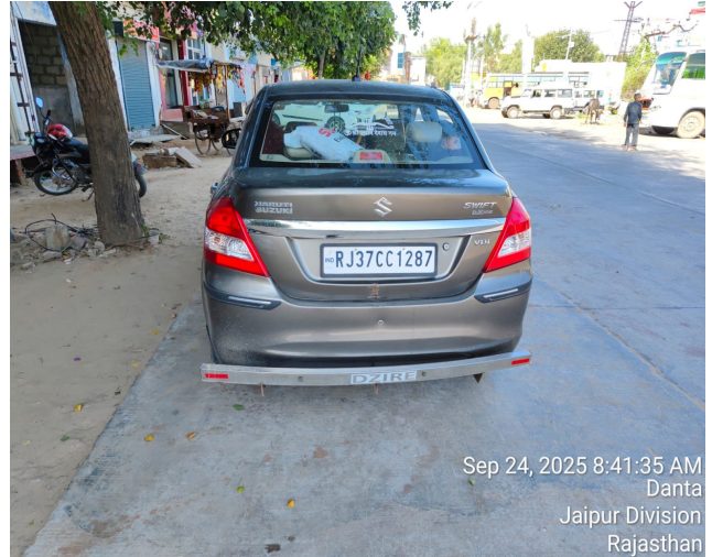
Sep 24, 2025 8:41:35 AM Danta Jaipur Division Rajasthan