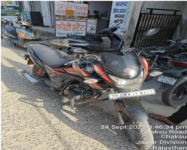
24 Sept 2025 3:46:34 pm Chaksu Road Chaksu Jaipur Division Rajasthan