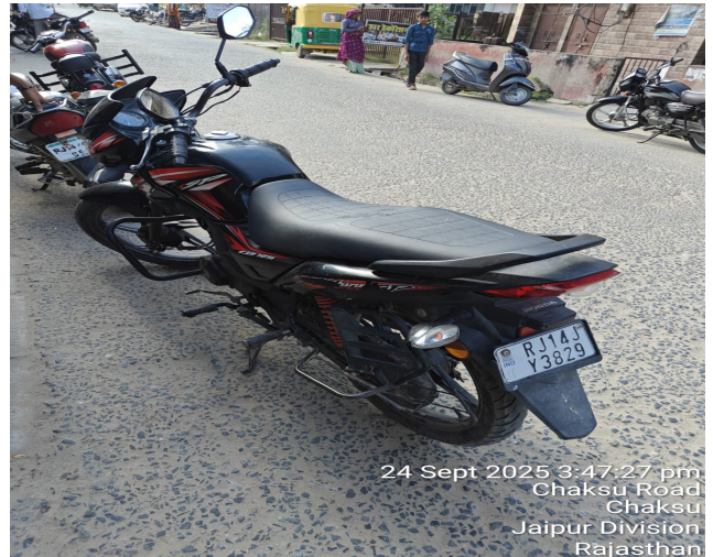
24 Sept 2025 3:47:27 pm Chaksu Road Chaksu Jaipur Division Rajasthan