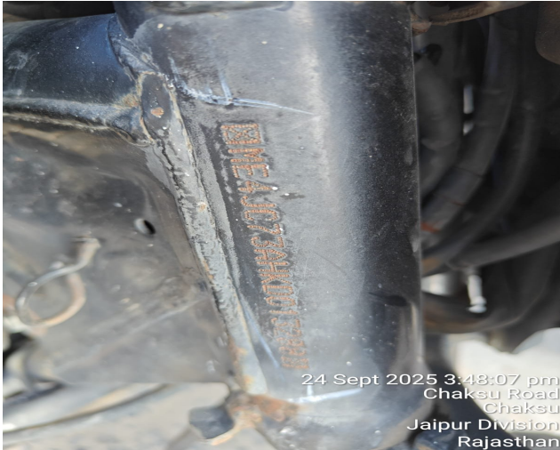
24 Sept 2025 3:48:07 pm Chaksu Road Chaksu Jaipur Division Rajasthan