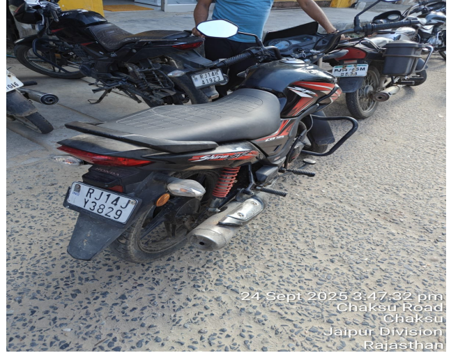
24 Sept 2025 3:47:32 pm Chaksu Road Chaksu Jaipur Division Rajasthan