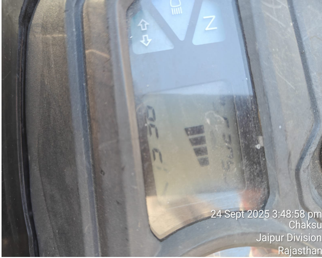
24 Sept 2025 3:48:58 pm Chaksu Jaipur Division Rajasthan

Surveyor & Loss Assessor (SLA / 65869 Valid up to 27-09-27)