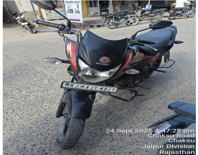
24 Sept 2025 3:47:22 pm Chaksu Road Chaksu Jaipur Division Rajasthan