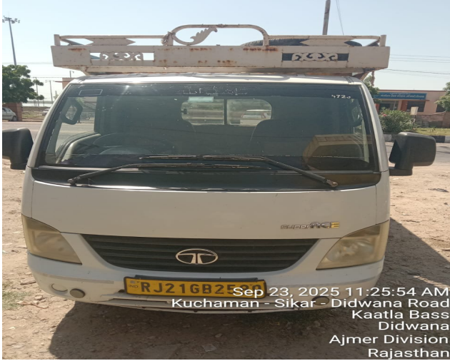
Sep 23, 2025 11:25:54 AM Kuchaman - Sikar - Didwana Road Kaatla Bass Didwana Ajmer Division Rajasthan

Surveyor & Loss Assessor (SLA / 65869 Valid up to 27-09-27)