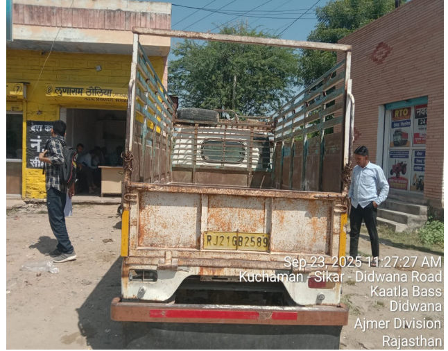
Sep 23, 2025 11:27:27 AM Kuchaman - Sikar - Didwana Road Kaatla Bass Didwana Ajmer Division Rajasthan