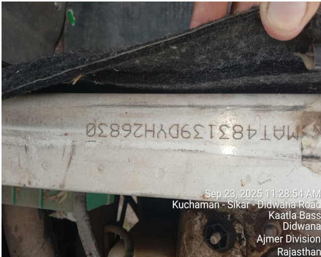
Sep 23, 2025 11:28:54 AM Kuchaman - Sikar - Didwana Road Kaatla Bass Didwana Ajmer Division Rajasthan