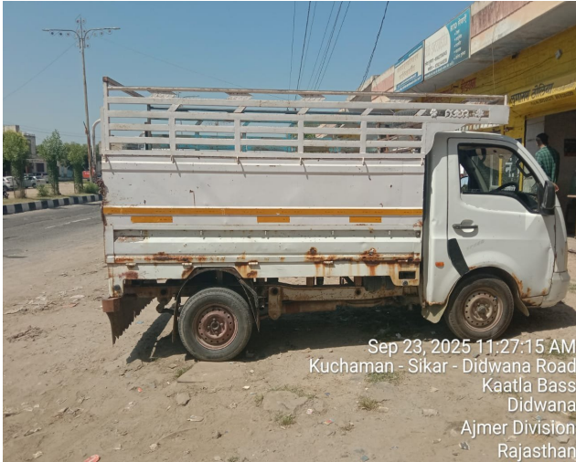
Sep 23, 2025 11:27:15 AM Kuchaman - Sikar - Didwana Road Kaatla Bass Didwana Ajmer Division Rajasthan