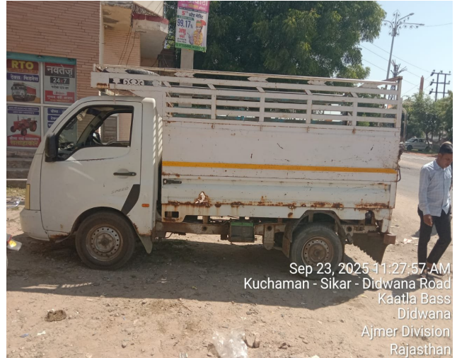
Sep 23, 2025 11:27:57 AM Kuchaman - Sikar - Didwana Road Kaatla Bass Didwana Ajmer Division Rajasthan