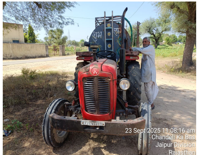
23 Sept 2025 11:08:16 am Chandeli Ka Bas Jaipur Division Rajasthan