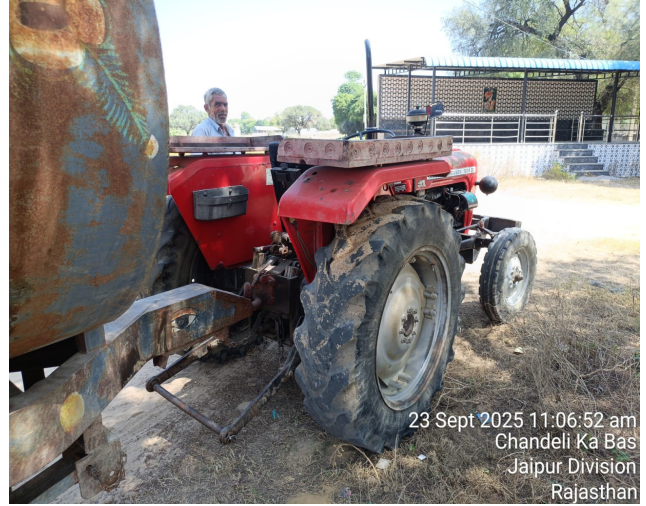
23 Sept 2025 11:06:52 am Chandeli Ka Bas Jaipur Division Rajasthan