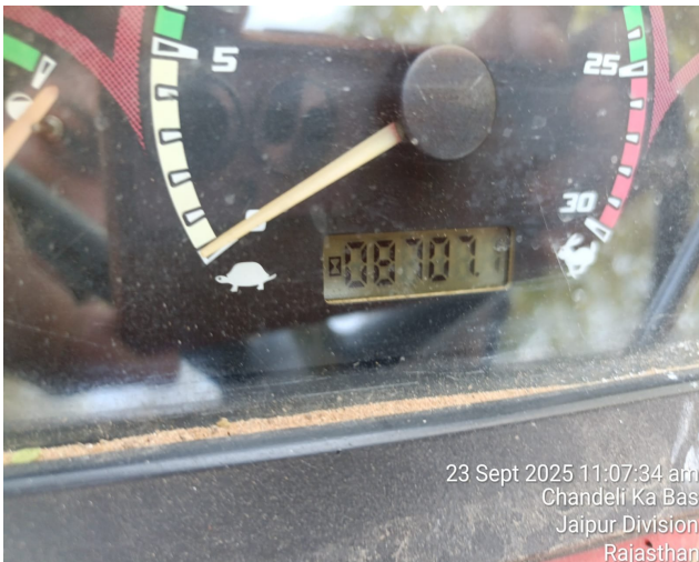
23 Sept 2025 11:07:34 am Chandeli Ka Bas Jaipur Division Rajasthan