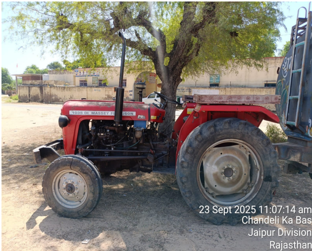
23 Sept 2025 11:07:14 am Chandeli Ka Bas Jaipur Division Rajasthan