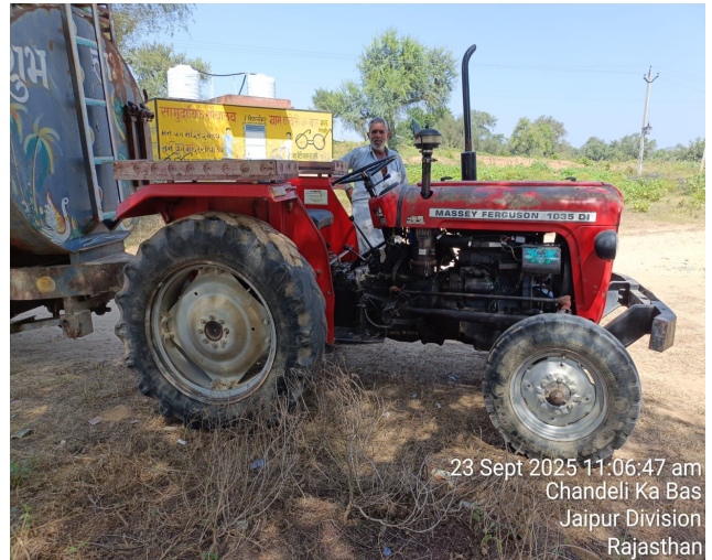
23 Sept 2025 11:06:47 am Chandeli Ka Bas Jaipur Division Rajasthan