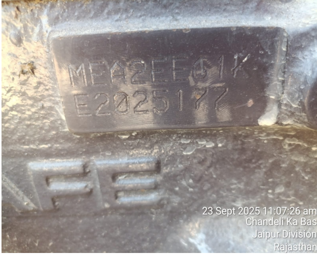
23 Sept 2025 11:07:26 am Chandeli Ka Bas Jaipur Division Rajasthan

Surveyor & Loss Assessor (SLA / 65869 Valid up to 27-09-27)