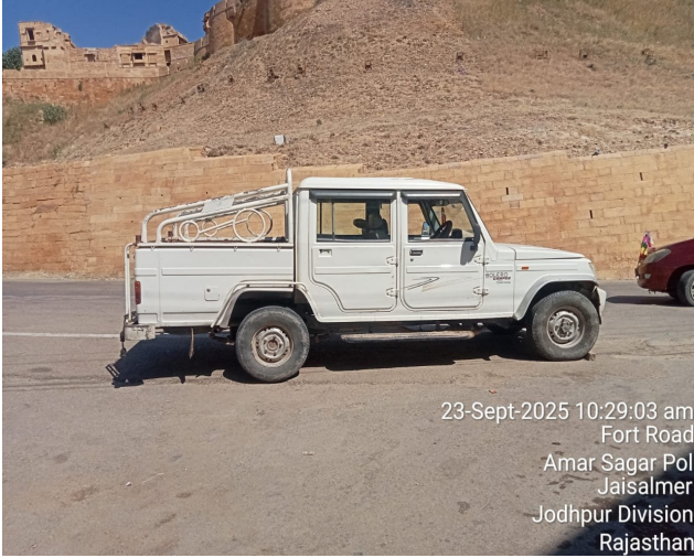
23-Sept-2025 10:29:03 am Fort Road Amar Sagar Pol Jaisalmer Jodhpur Division Rajasthan

Surveyor & Loss Assessor (SLA / 65869 Valid up to 27-09-27)