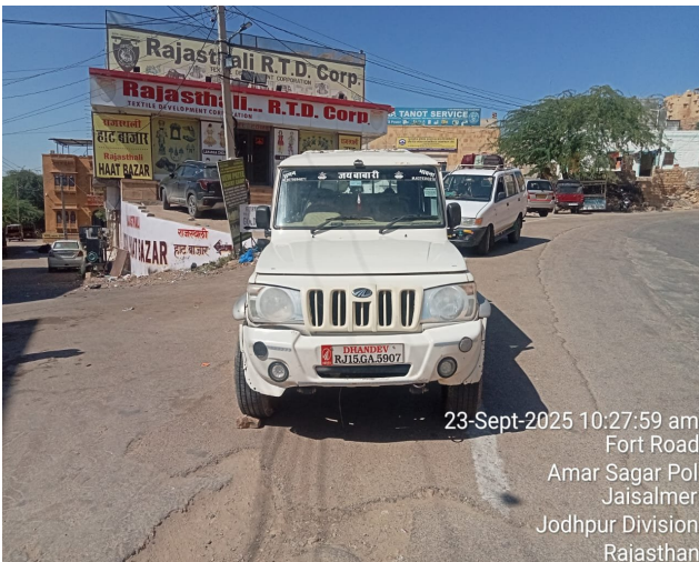
23-Sept-2025 10:27:59 am Fort Road Amar Sagar Pol Jaisalmer Jodhpur Division Rajasthan