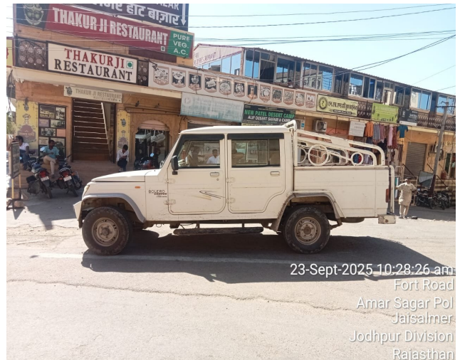
23-Sept-2025 10:28:26 am Fort Road Amar Sagar Pol Jaisalmer Jodhpur Division Rajasthan