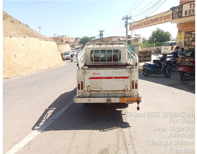
23-Sept-2025 10:28:45 am Fort Road Amar Sagar Pol Jaisalmer Jodhpur Division Rajasthan