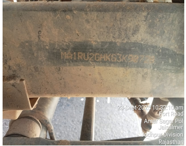
23-Sept-2025 10:32:10 am Fort Road Amar Sagar Pol Jaisalmer Jodhpur Division Rajasthan