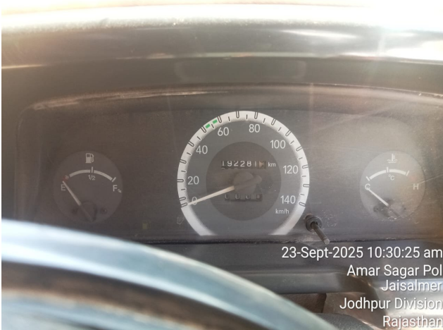
23-Sept-2025 10:30:25 am Amar Sagar Pol Jaisalmer Jodhpur Division Rajasthan