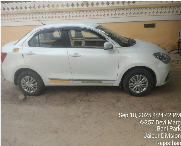
Sep 18, 2025 4:24:42 PM A-257 Devi Marg Bani Park Jaipur Division Rajasthan