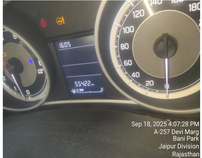
Sep 18, 2025 4:07:28 PM A-257 Devi Marg Bani Park Jaipur Division Rajasthan