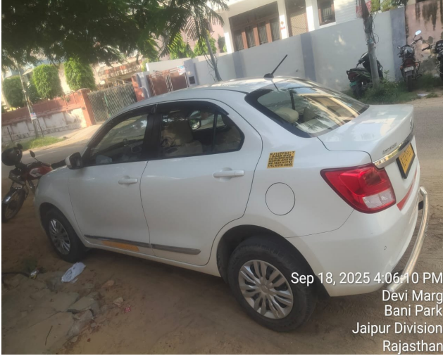
Sep 18, 2025 4:06:10 PM Devi Marg Bani Park Jaipur Division Rajasthan

Surveyor & Loss Assessor (SLA / 65869 Valid up to 27-09-27)