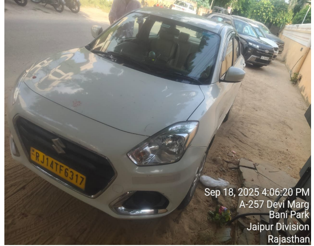
Sep 18, 2025 4:06:20 PM A-257 Devi Marg Bani Park Jaipur Division Rajasthan