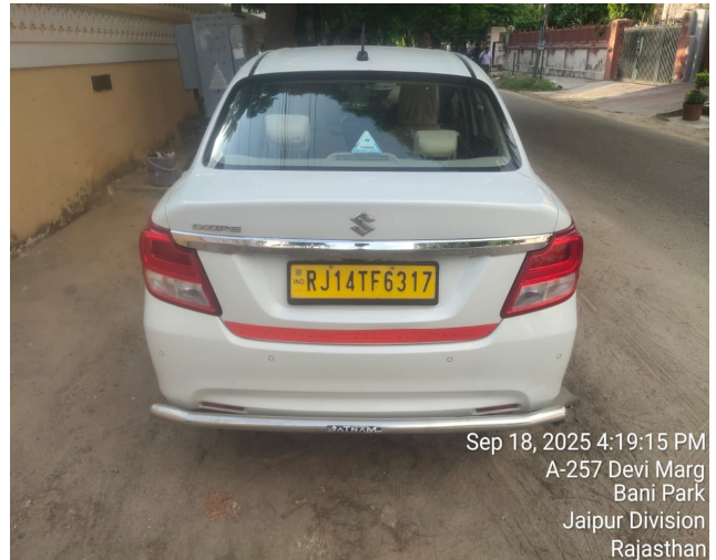
Sep 18, 2025 4:19:15 PM A-257 Devi Marg Bani Park Jaipur Division Rajasthan