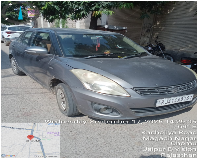
Wednesday, September 17, 2025 14:29:05 69° E Kacholiya Road Magadh Nagar Chomu Jaipur Division Rajasthan