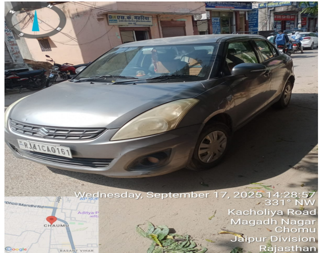
Wednesday, September 17, 2025 14:28:57 331° NW Kacholiya Road Magadh Nagar Chomu Jaipur Division Rajasthan