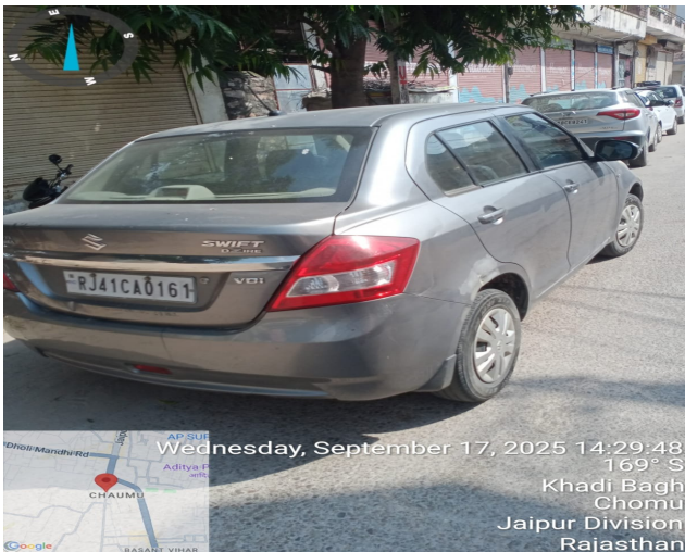
Wednesday, September 17, 2025 14:29:48 169° S Khadi Bagh Chomu Jaipur Division Rajasthan