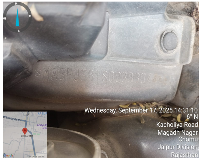
Wednesday, September 17, 2025 14:31:10 6° N Kacholiya Road Magadh Nagar Chomu Jaipur Division Rajasthan