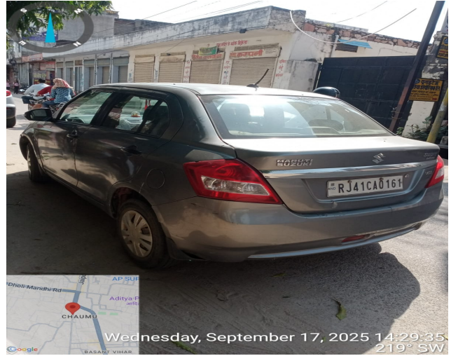
Wednesday, September 17, 2025 14:29:35 219° SW