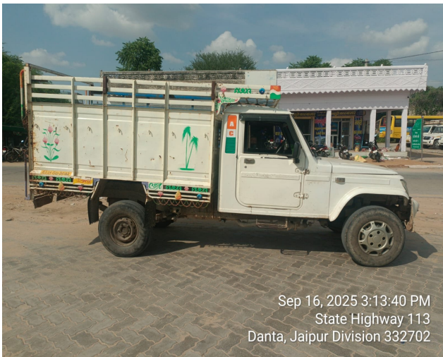
Sep 16, 2025 3:13:40 PM State Highway 113 Danta, Jaipur Division 332702