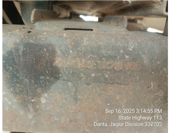
Sep 16, 2025 3:14:55 PM State Highway 113 Danta, Jaipur Division 332702