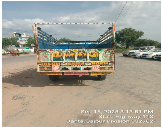
Sep 16, 2025 3:13:51 PM State Highway 113 Danta, Jaipur Division 332702