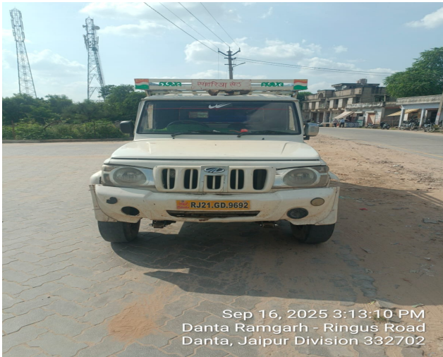
Sep 16, 2025 3:13:10 PM Danta Ramgarh - Ringus Road Danta, Jaipur Division 332702