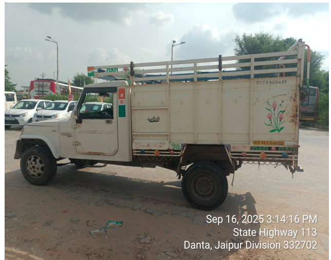
Sep 16, 2025 3:14:16 PM State Highway 113 Danta, Jaipur Division 332702