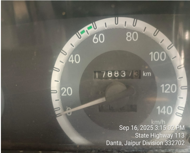
Sep 16, 2025 3:15:02 PM State Highway 113 Danta, Jaipur Division 332702

Surveyor & Loss Assessor (SLA / 65869 Valid up to 27-09-27)