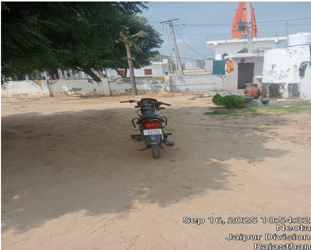
Sep 16, 2025 10:54:32 Neota Jaipur Division Rajasthan