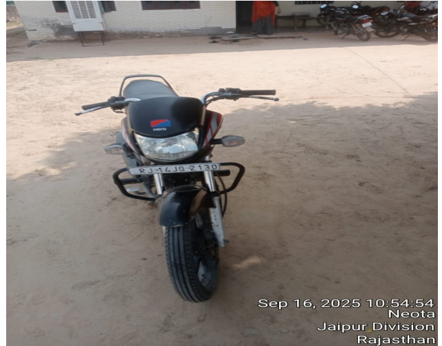
Sep 16, 2025 10:54:54 Neota Jaipur Division Rajasthan