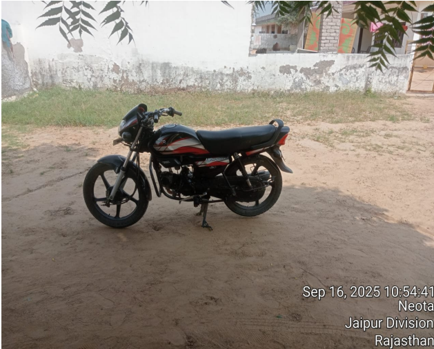
Sep 16, 2025 10:54:41 Neota Jaipur Division Rajasthan