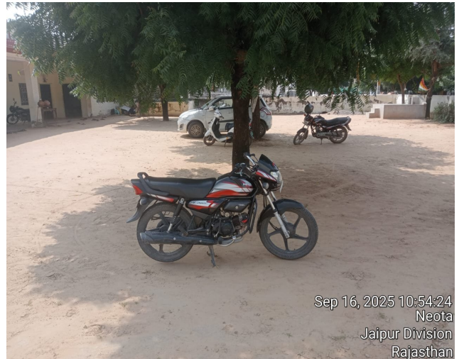
Sep 16, 2025 10:54:24 Neota Jaipur Division Rajasthan