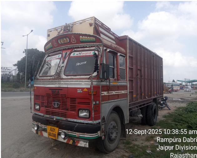
12-Sept-2025 10:38:55 am Rampura Dabri Jaipur Division Rajasthan