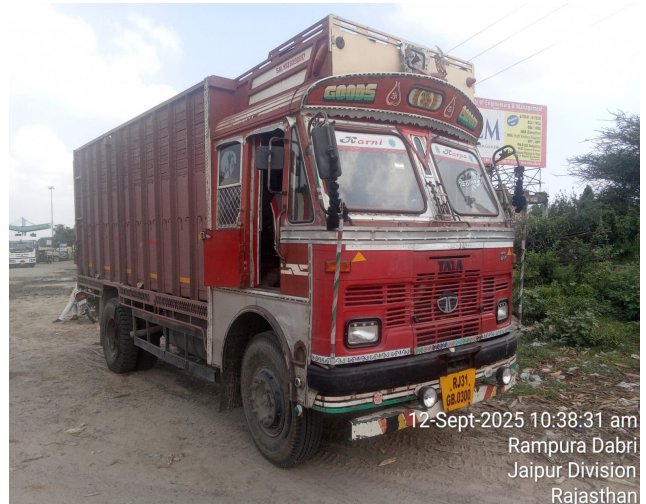
12-Sept-2025 10:38:31 am Rampura Dabri Jaipur Division Rajasthan