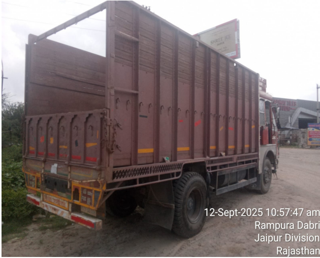
12-Sept-2025 10:57:47 am Rampura Dabri Jaipur Division Rajasthan