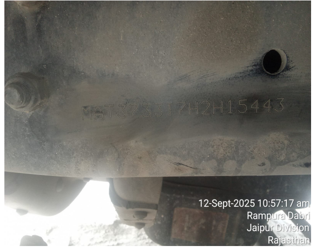
12-Sept-2025 10:57:17 am Rampura Dabri Jaipur Division Rajasthan