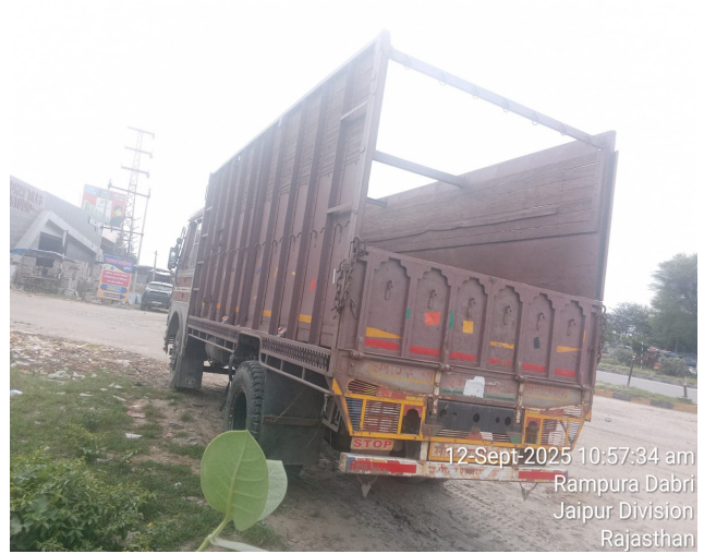
12-Sept-2025 10:57:34 am Rampura Dabri Jaipur Division Rajasthan