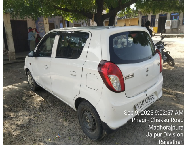
Sep 9, 2025 9:02:57 AM Phagi - Chaksu Road Madhorajpura Jaipur Division Rajasthan