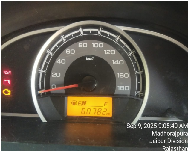
Sep 9, 2025 9:05:40 AM Madhorajpura Jaipur Division Rajasthan