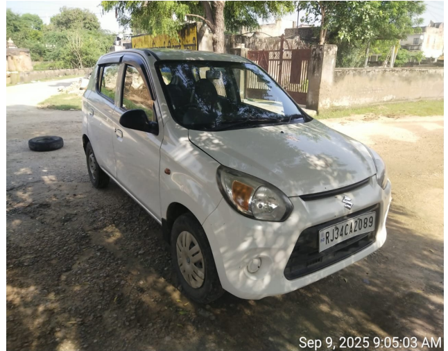
Sep 9, 2025 9:05:03 AM