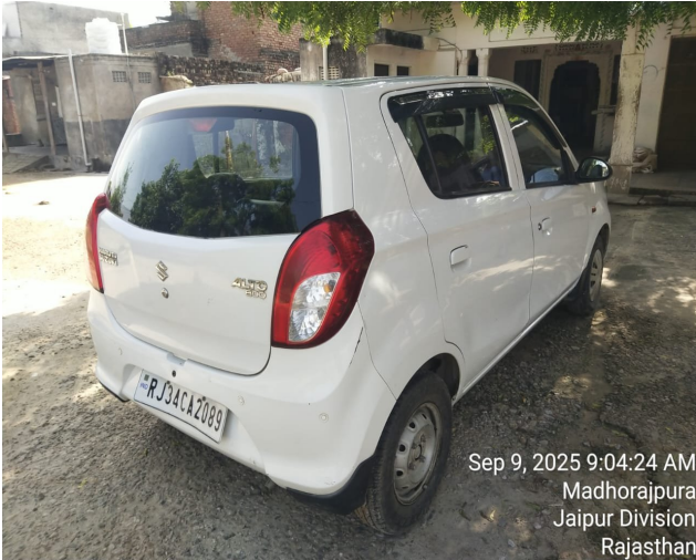
Sep 9, 2025 9:04:24 AM Madhorajpura Jaipur Division Rajasthan