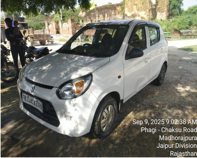
Sep 9, 2025 9:02:38 AM Phagi - Chaksu Road Madhorajpura Jaipur Division Rajasthan

Surveyor & Loss Assessor (SLA / 65869 Valid up to 27-09-27)