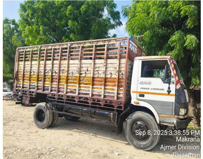
Sep 8, 2025 3:38:55 PM Makrana Ajmer Division Rajasthan