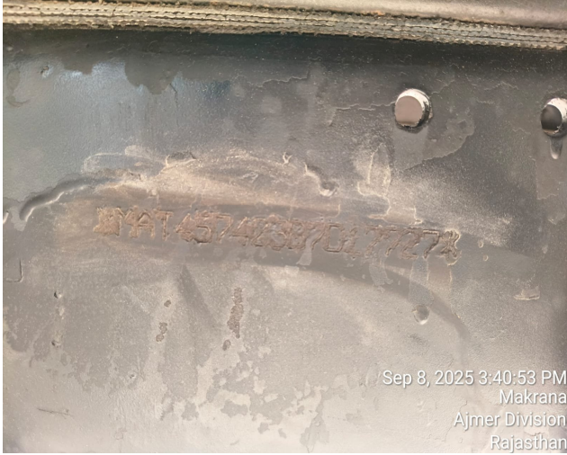
Sep 8, 2025 3:40:53 PM Makrana Ajmer Division Rajasthan

Surveyor & Loss Assessor (SLA / 65869 Valid up to 27-09-27)