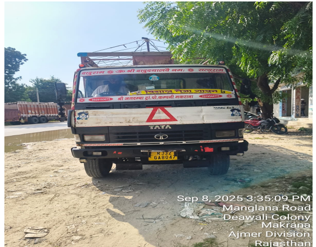
Sep 8, 2025 3:35:09 PM Manglana Road, Deawali Colony Makrana Ajmer Division Rajasthan