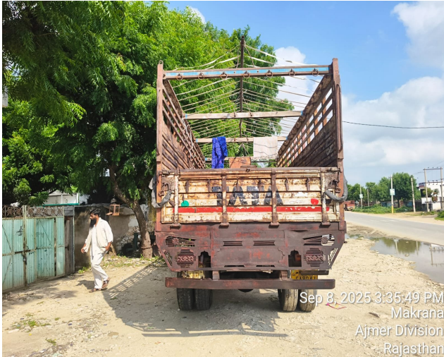
Sep 8, 2025 3:35:49 PM Makrana Ajmer Division Rajasthan