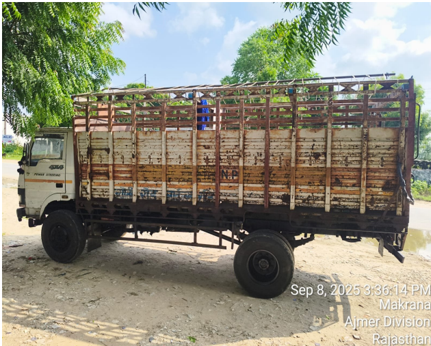
Sep 8, 2025 3:36:14 PM Makrana Ajmer Division Rajasthan