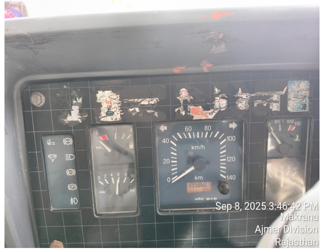
Sep 8, 2025 3:46:42 PM Makrana Ajmer Division Rajasthan